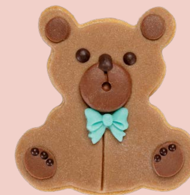
Decorated biscuit BSC033