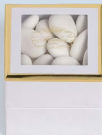
Customizable cube of confetti