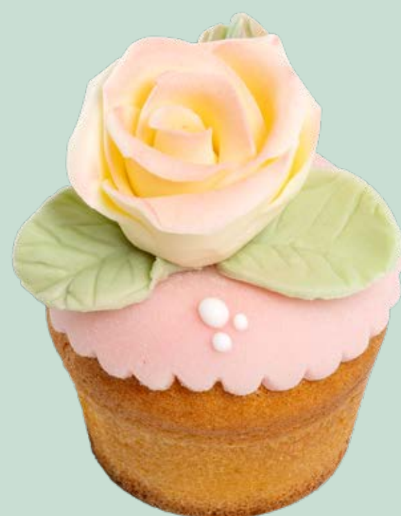
Decorated muffin MF021