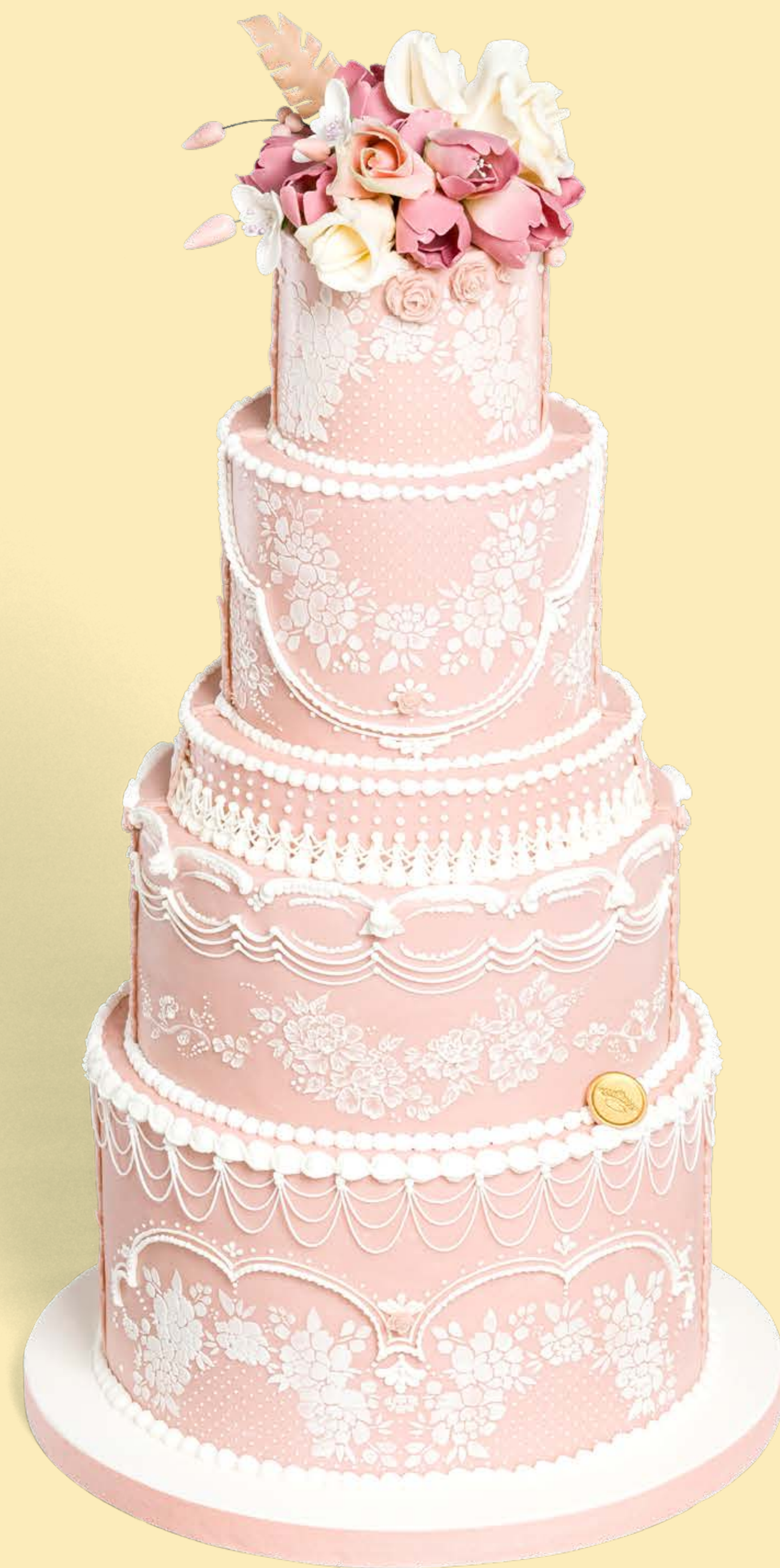
Color: CLR004 Base decoration: DCR014