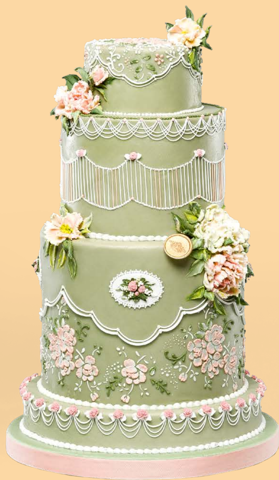
Color: CLR007 Base decoration: DCR016