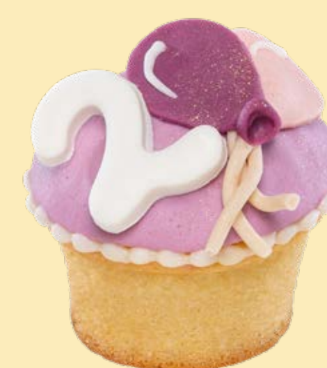
Decorated muffin MF011