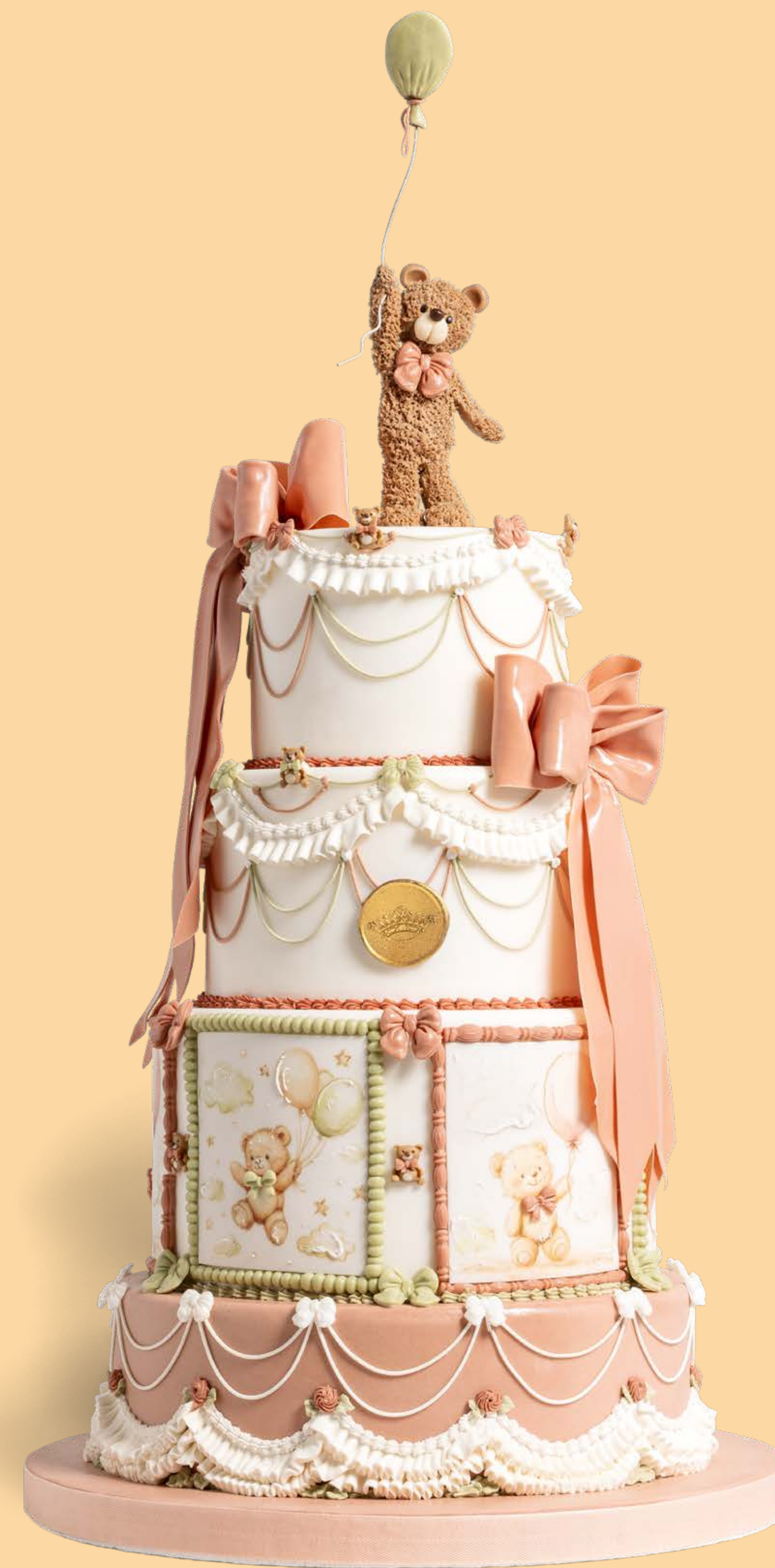
Color: CLR004 + CLR006 Base decoration: DCR033