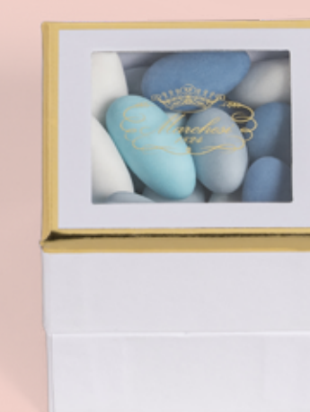
Customizable cube of confetti