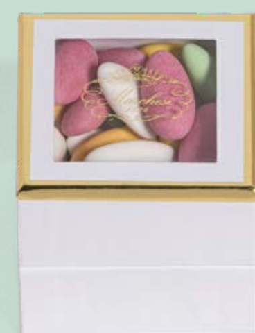
Customizable cube of confetti