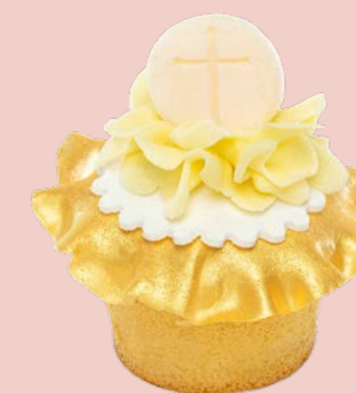
Decorated muffin MF008