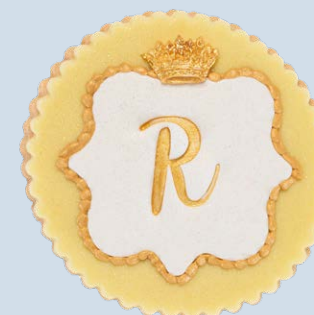
Decorated biscuit BSC024