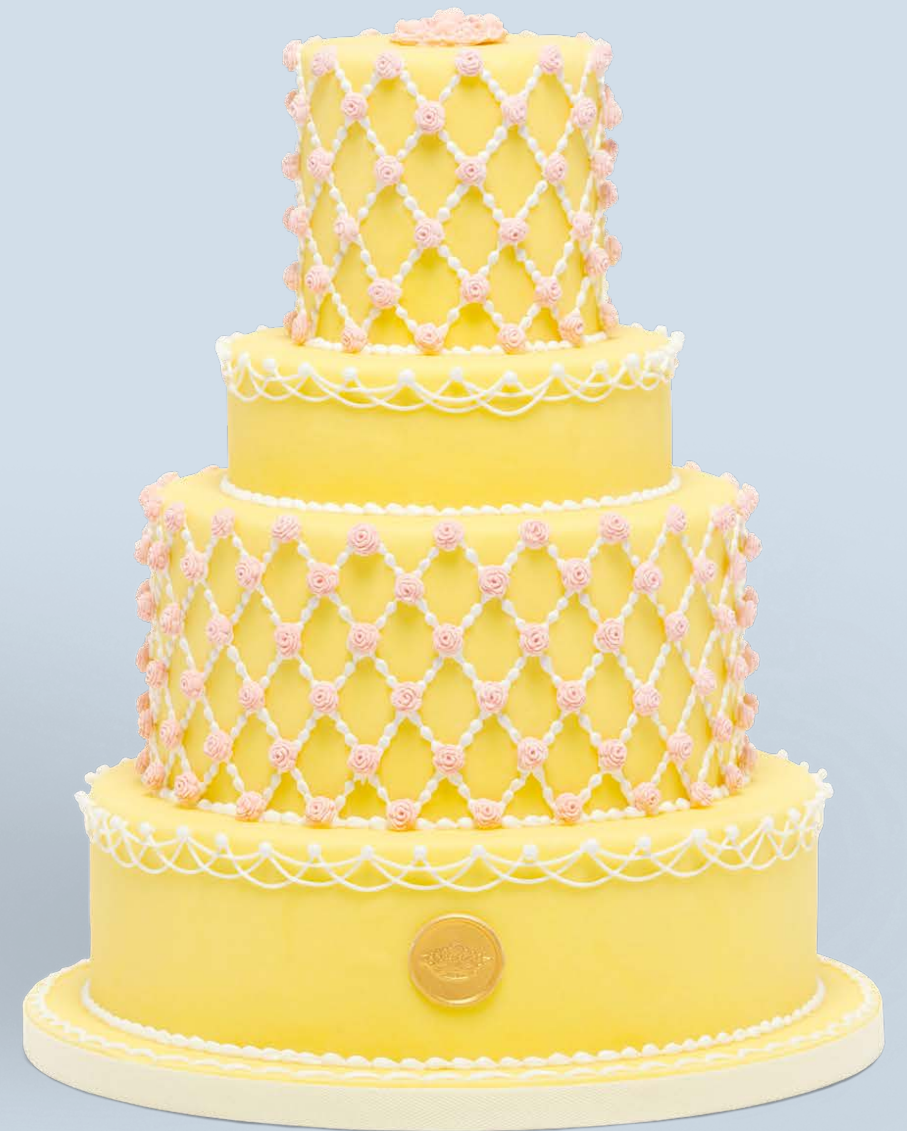
Color: CLR001 Base decoration: DCR015