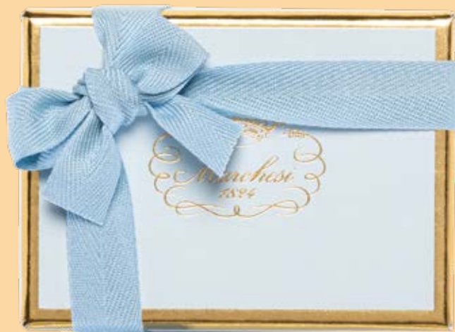
Customizable box of jellies, cremini and pralines