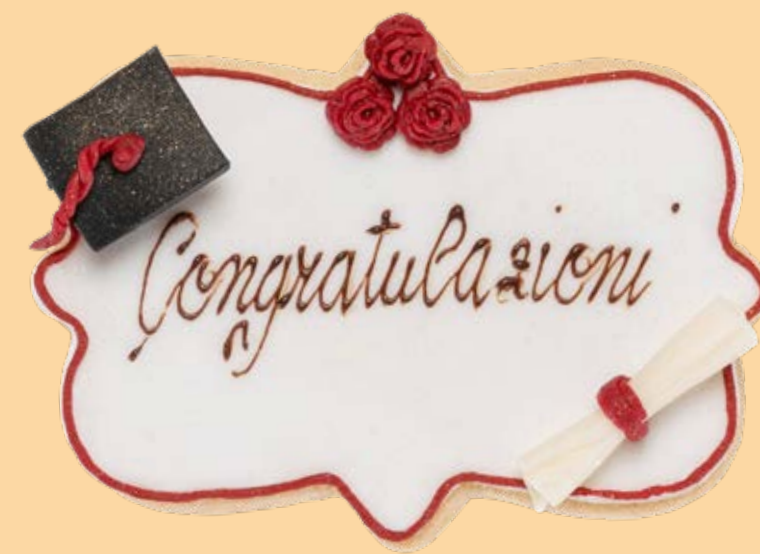
Decorated biscuit BSC007