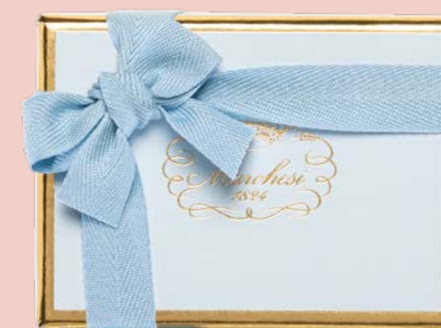
Customizable box of jellies, cremini and pralines