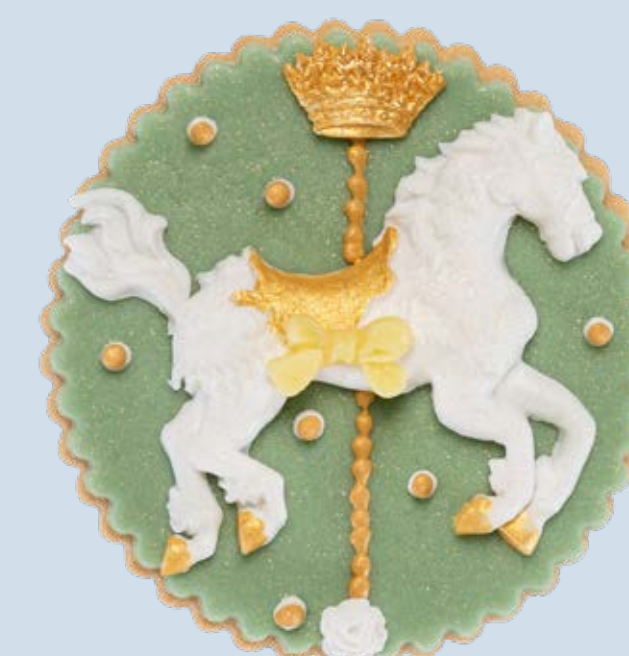
Decorated biscuit BSC026