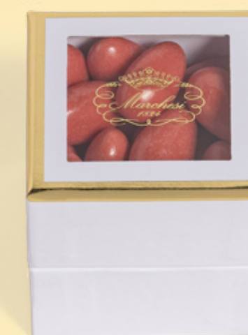
Customizable cube of confetti