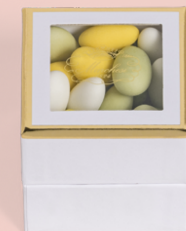
Customizable cube of confetti