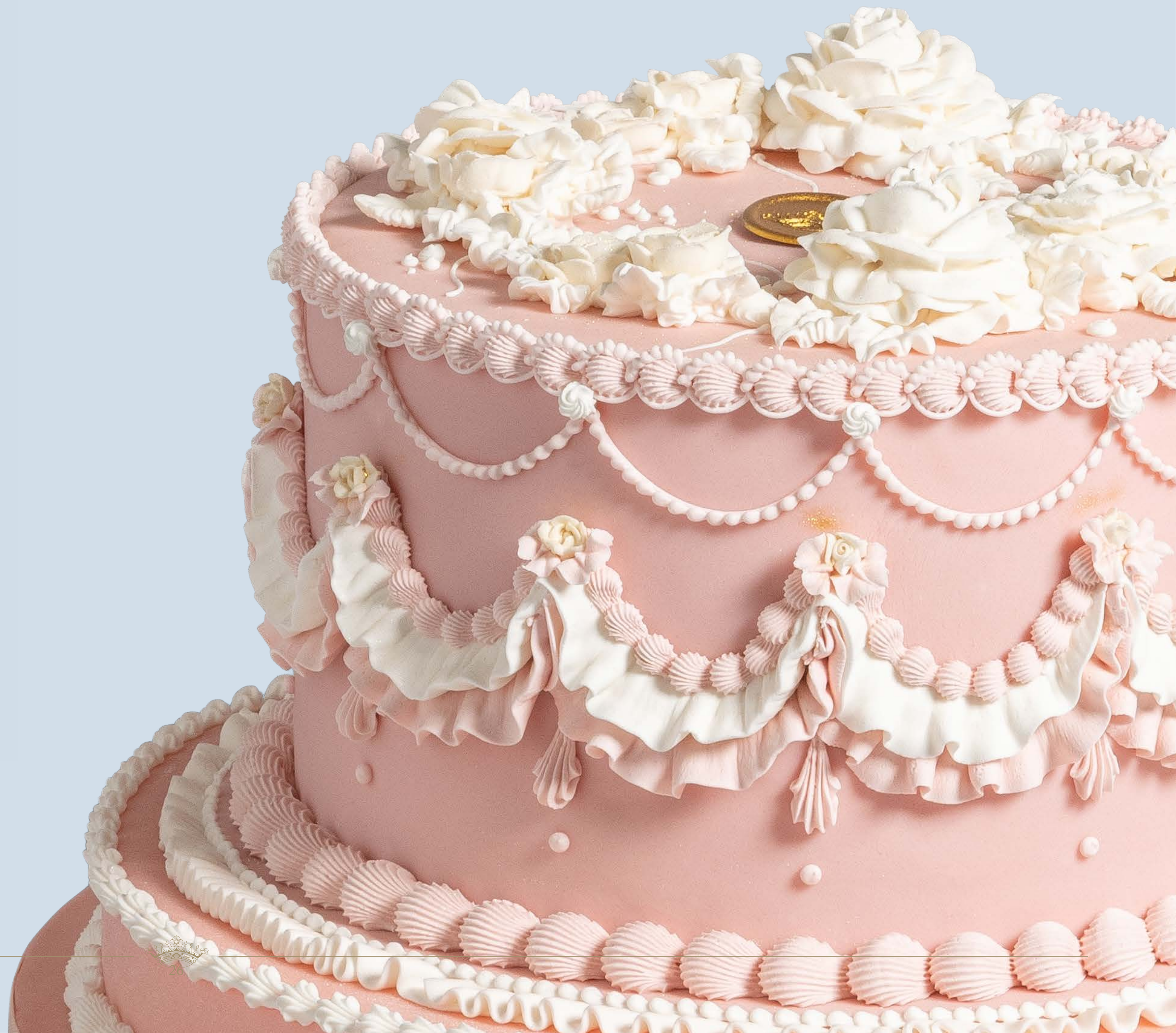
Color: CLR004 Base decoration: DCR0102