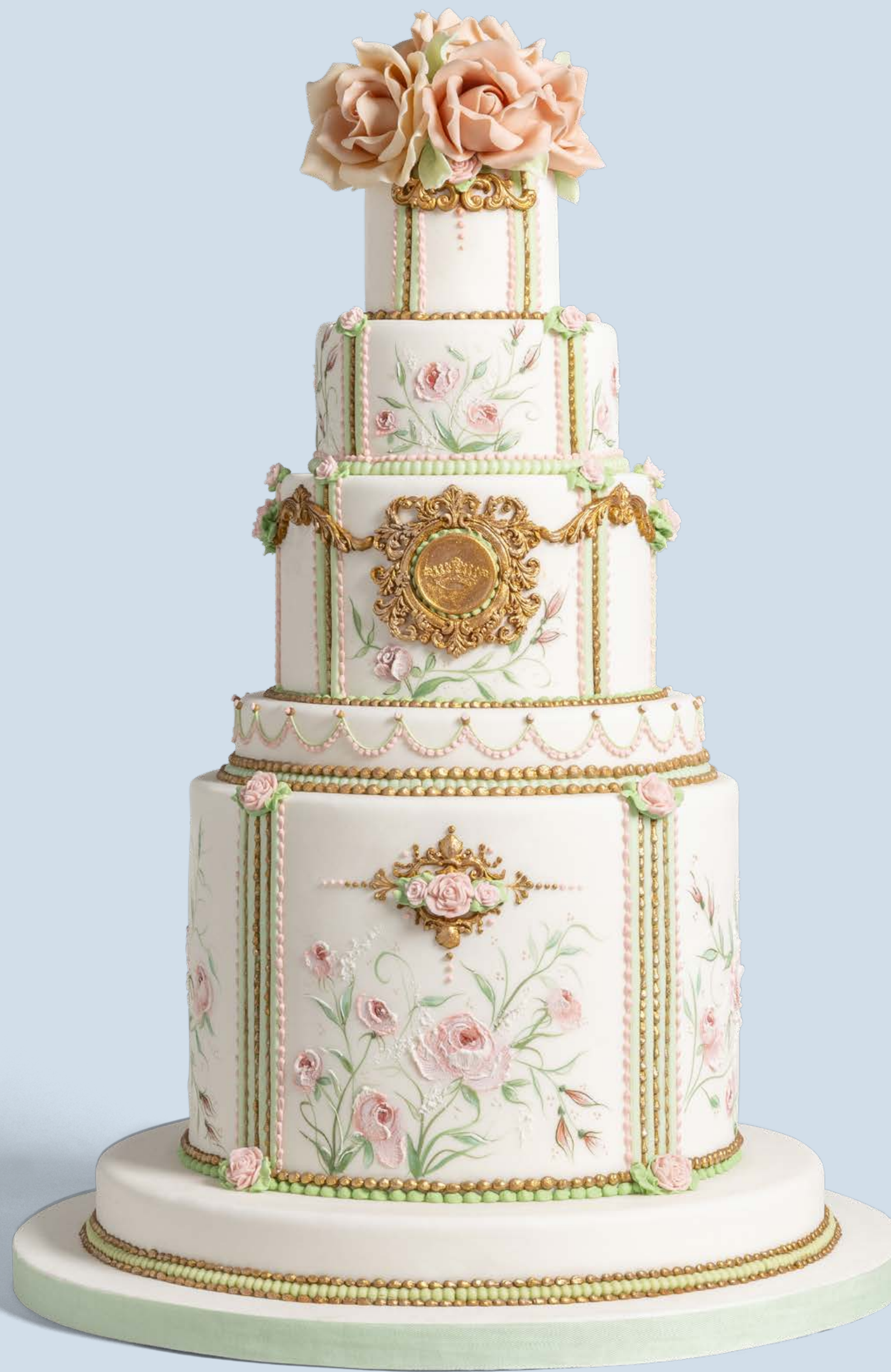
Color: CLR006 Base decoration: DCR0100