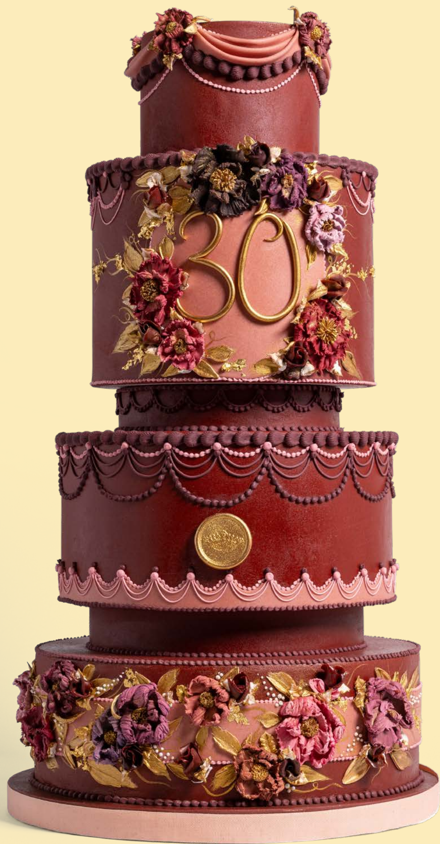
Color: CLR020 + CLR004 Base decoration: DCR034