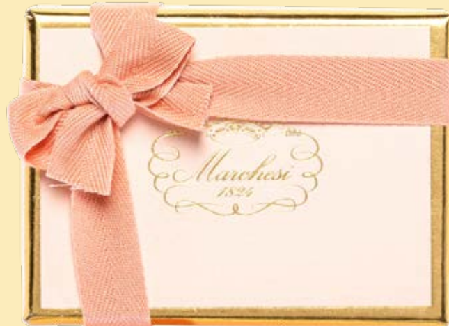
Customizable box of jellies, cremini and pralines