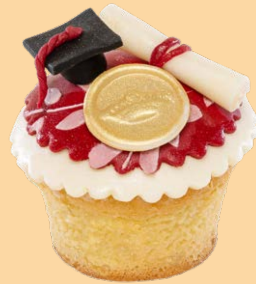
Decorated muffin MF007