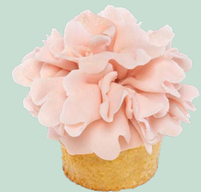
Decorated muffin MF005