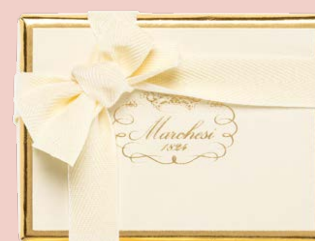
Customizable box of jellies, cremini and pralines