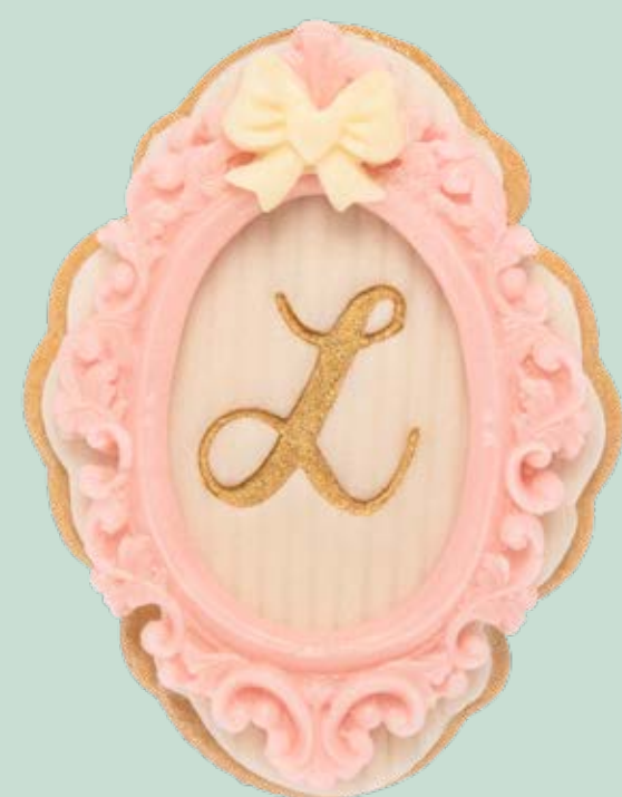
Decorated biscuit BSC031