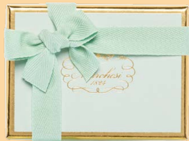
Customizable box of jellies, cremini and pralines