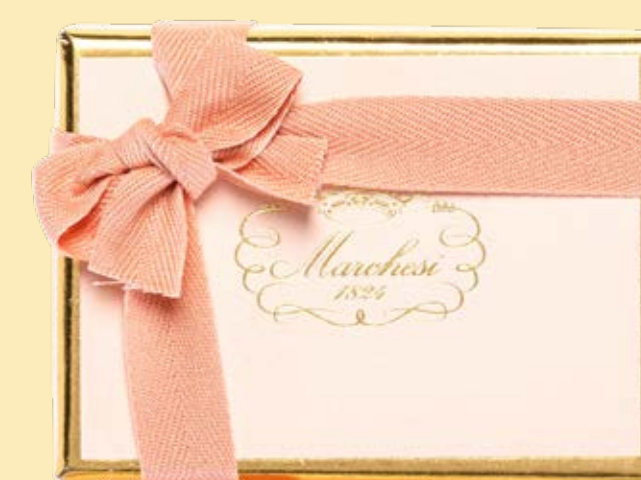
Customizable box of jellies, cremini and pralines