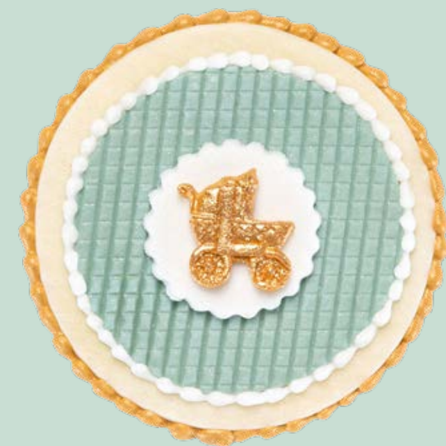
Decorated biscuit BSC012