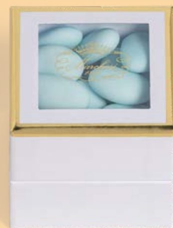
Customizable cube of confetti