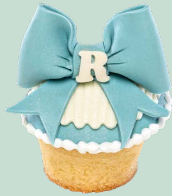
Decorated muffin MF009