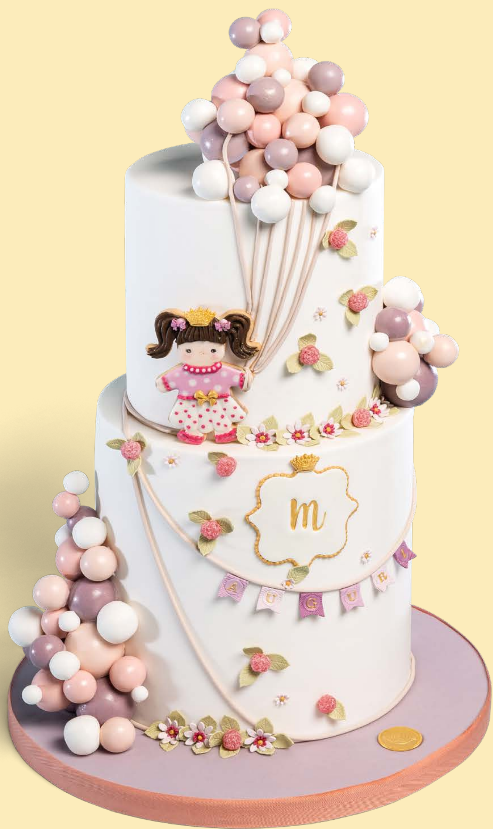
Color: CLR006 Base decoration: DCR008