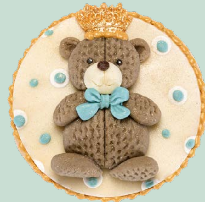
Decorated biscuit BSC010