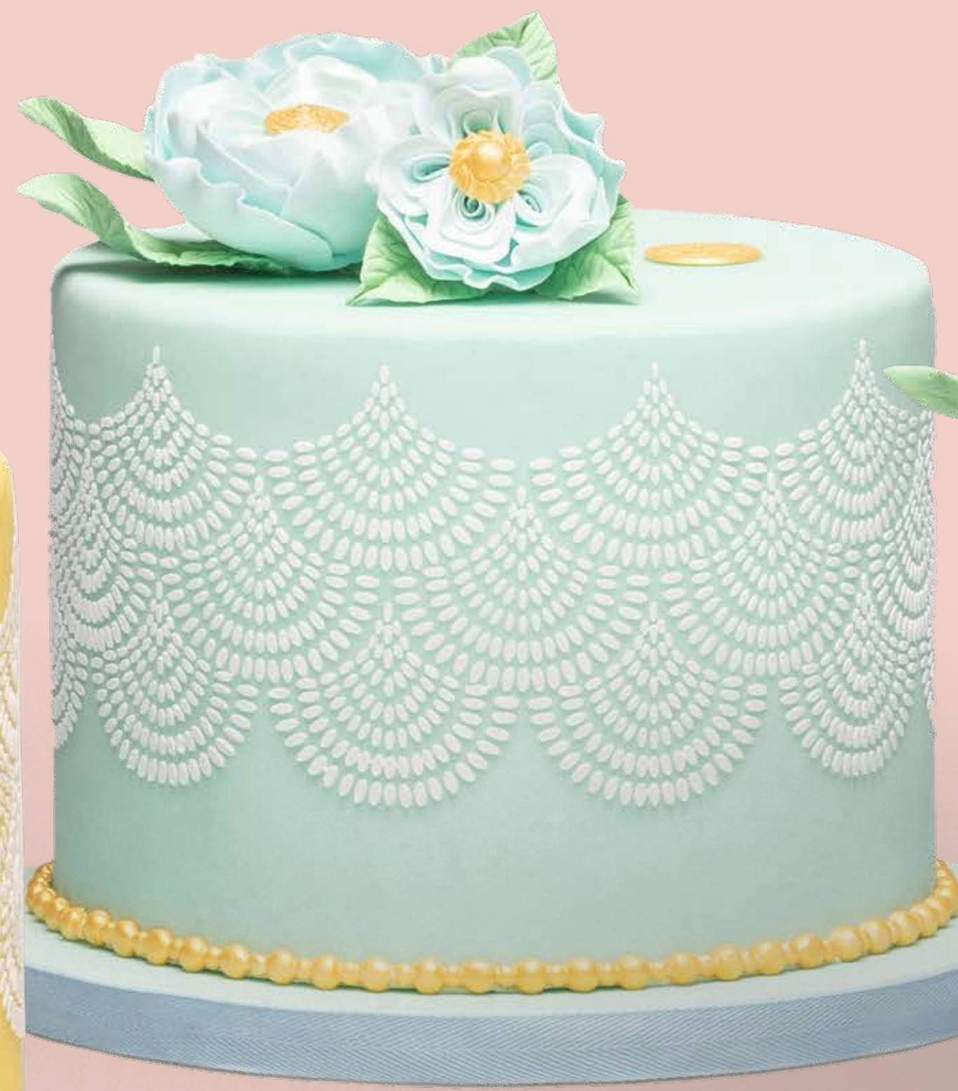
Color: CLR002 Base decoration: DCR001