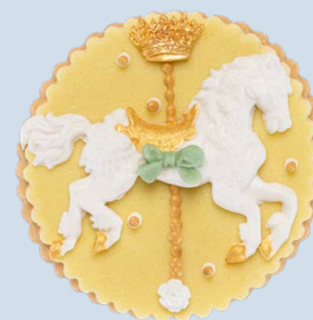
Decorated biscuit BSC025