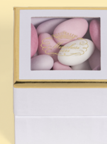
Customizable cube of confetti