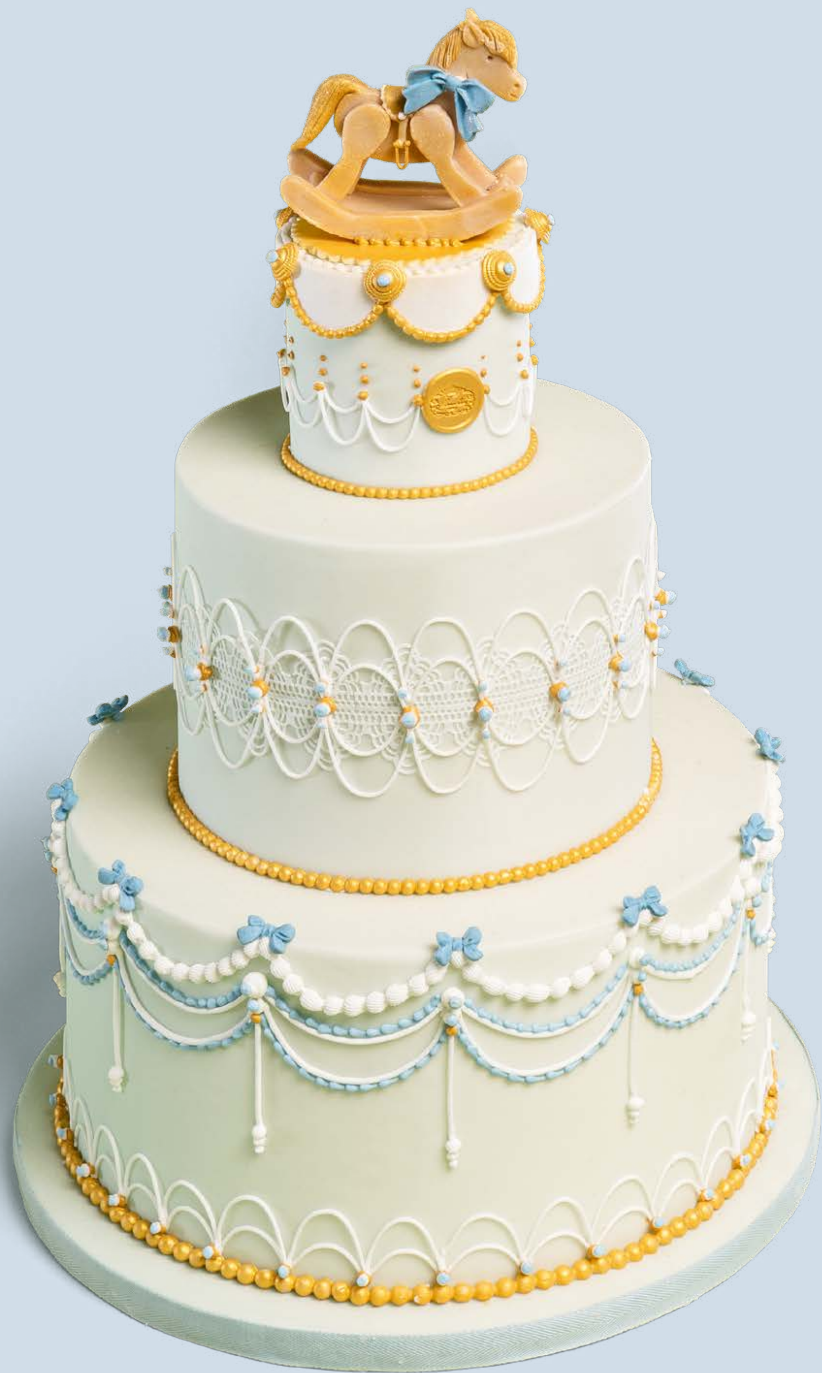
Color: CLR002 Base decoration: DCR010