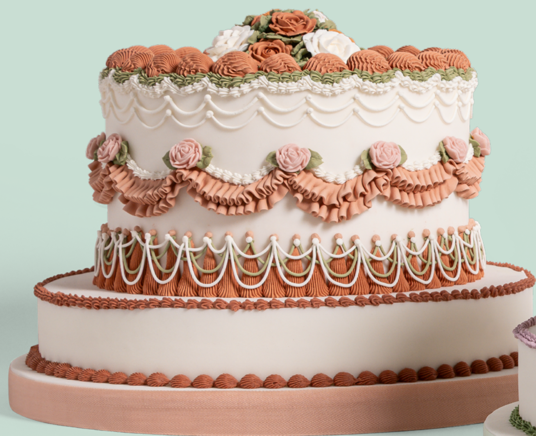
Color: CLR006 Base decoration: DCR027