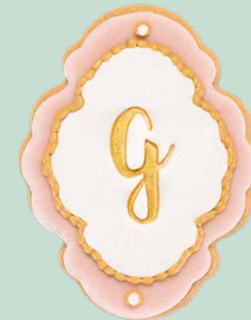
Decorated biscuit BSC004