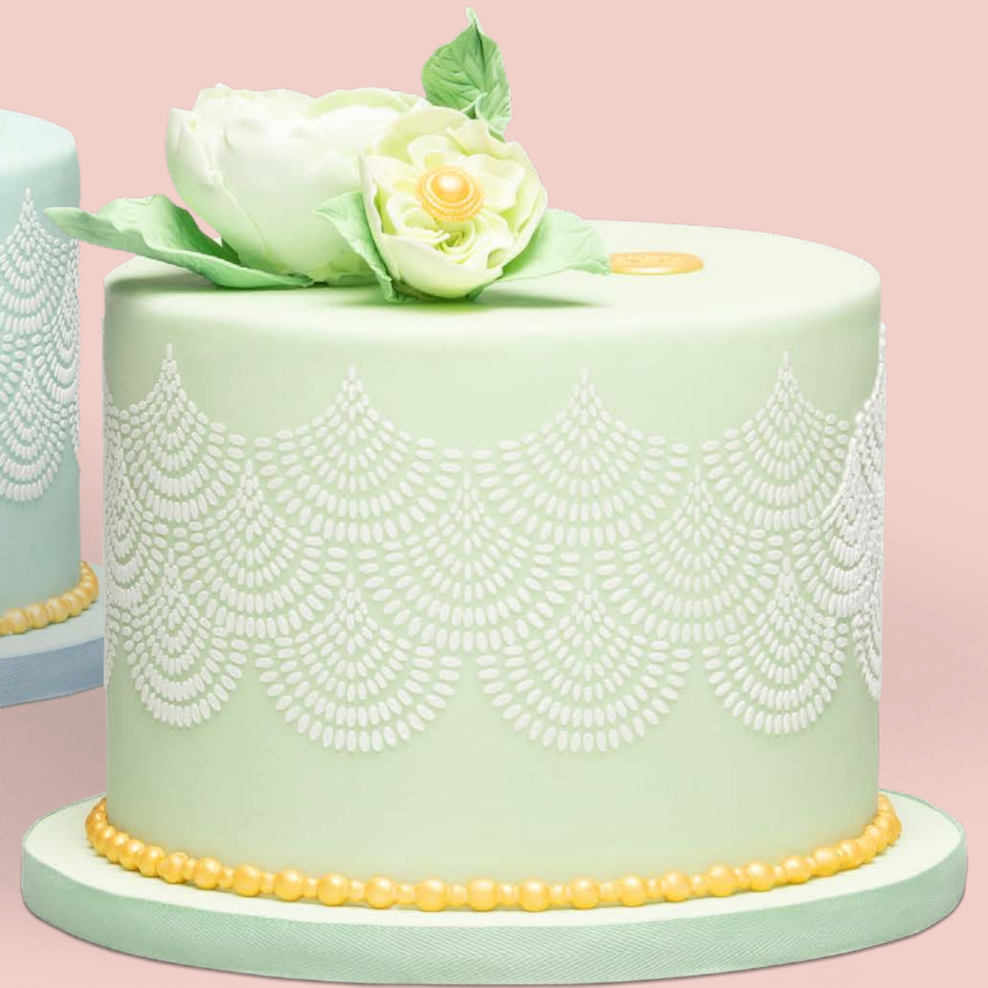
Color: CLR003 Base decoration: DCR001