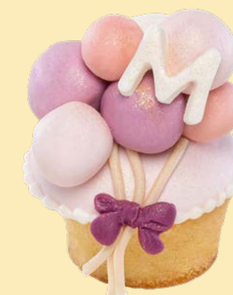
Decorated muffin MF012