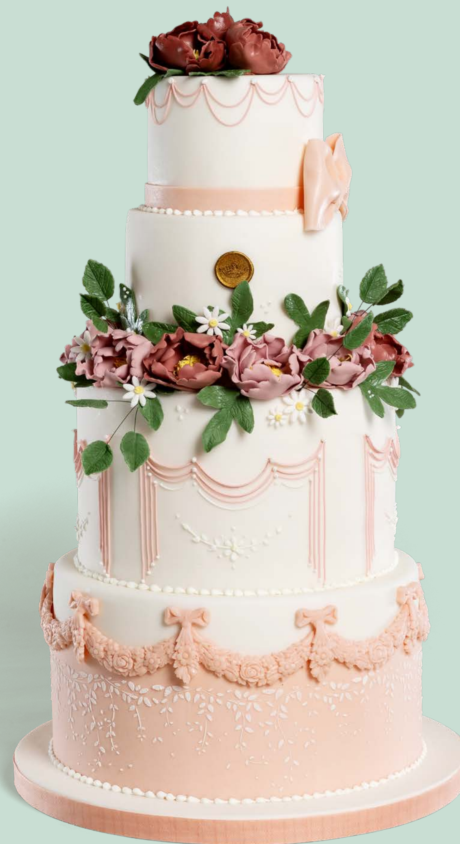
Color: CLR006 + CLR004 Base decoration: DCR022