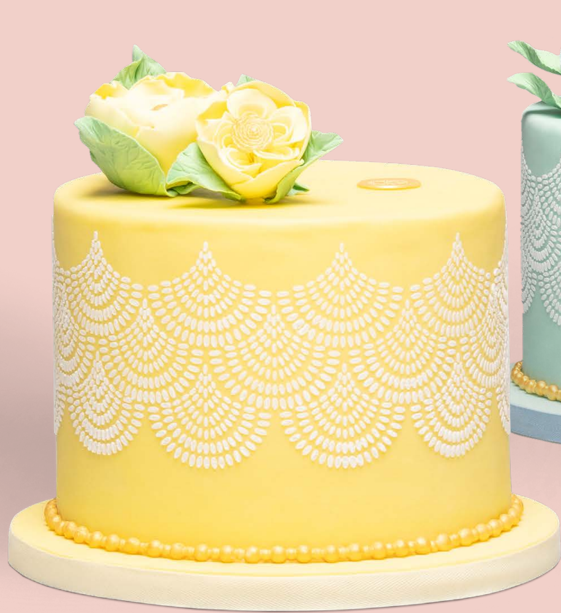
Color: CLR001 Base decoration: DCR001