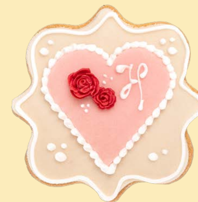
Decorated biscuit BSC032