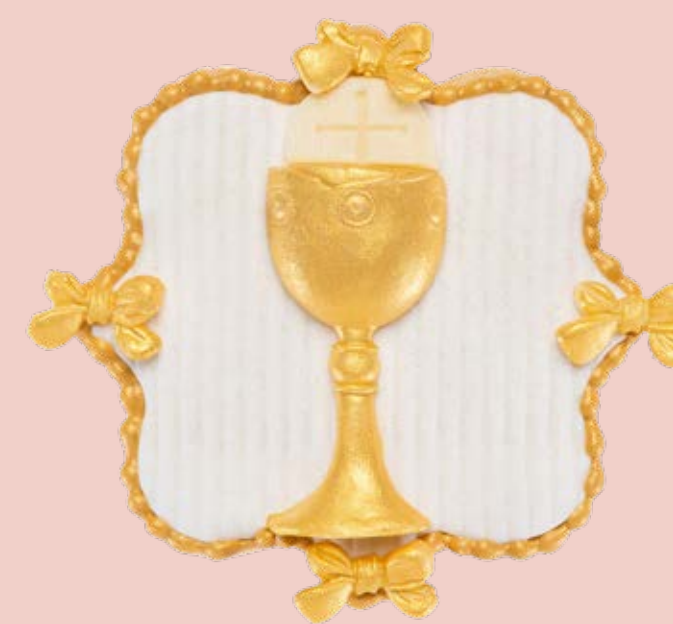
Decorated biscuit BSC008