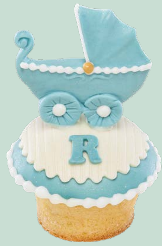
Decorated muffin MF010