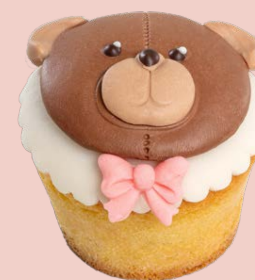
Decorated muffin MF023