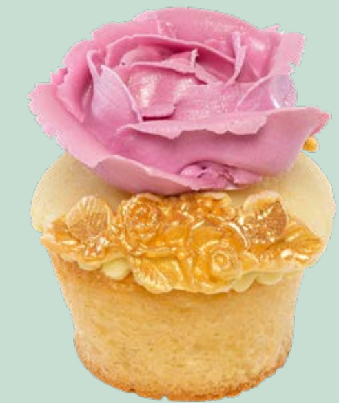
Decorated muffin MF002