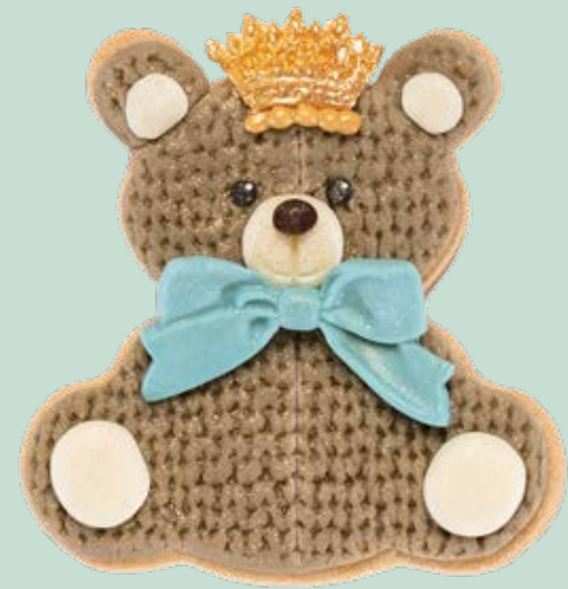
Decorated biscuit BSC009