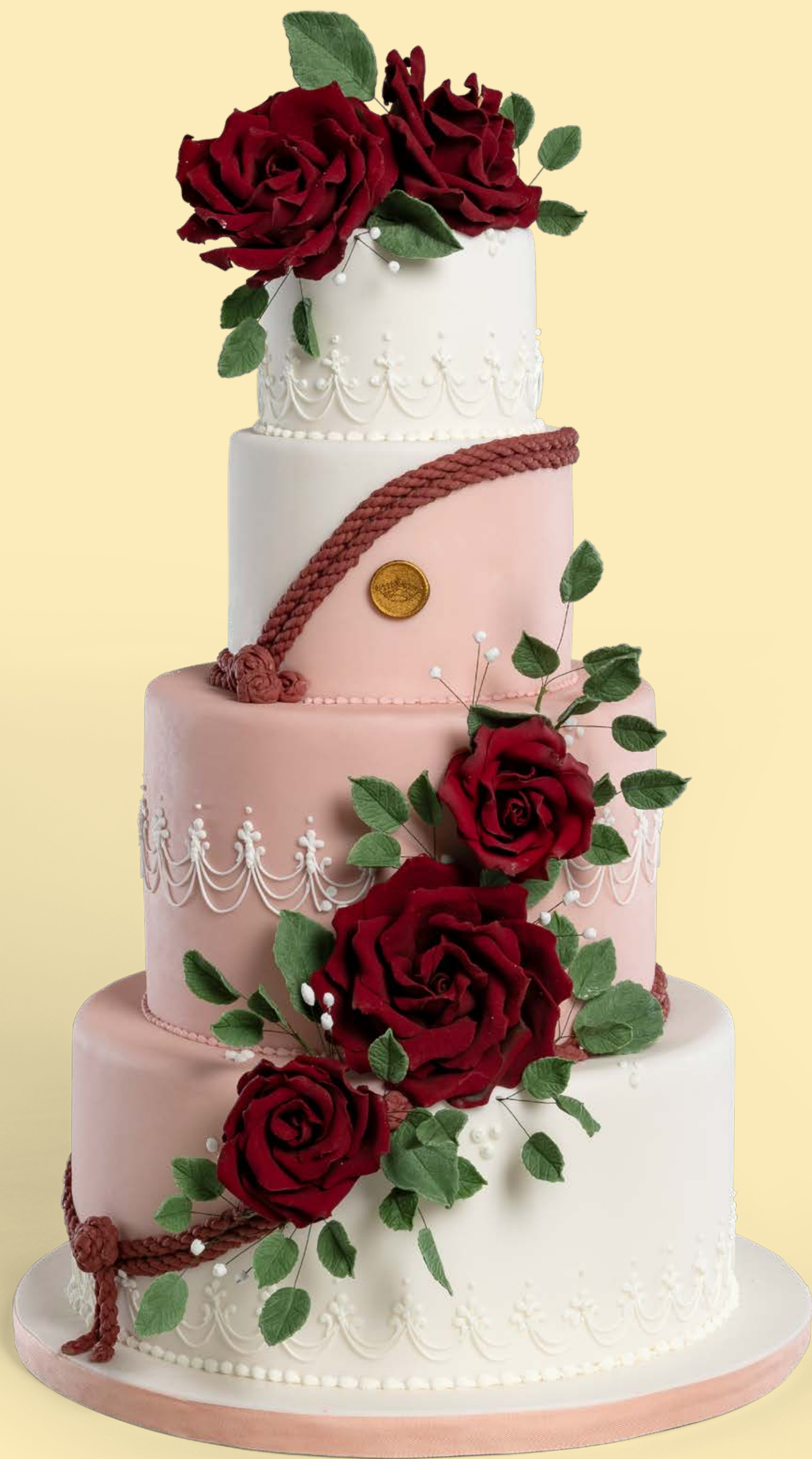
Color: CLR004 + CLR006 Base decoration: DCR024