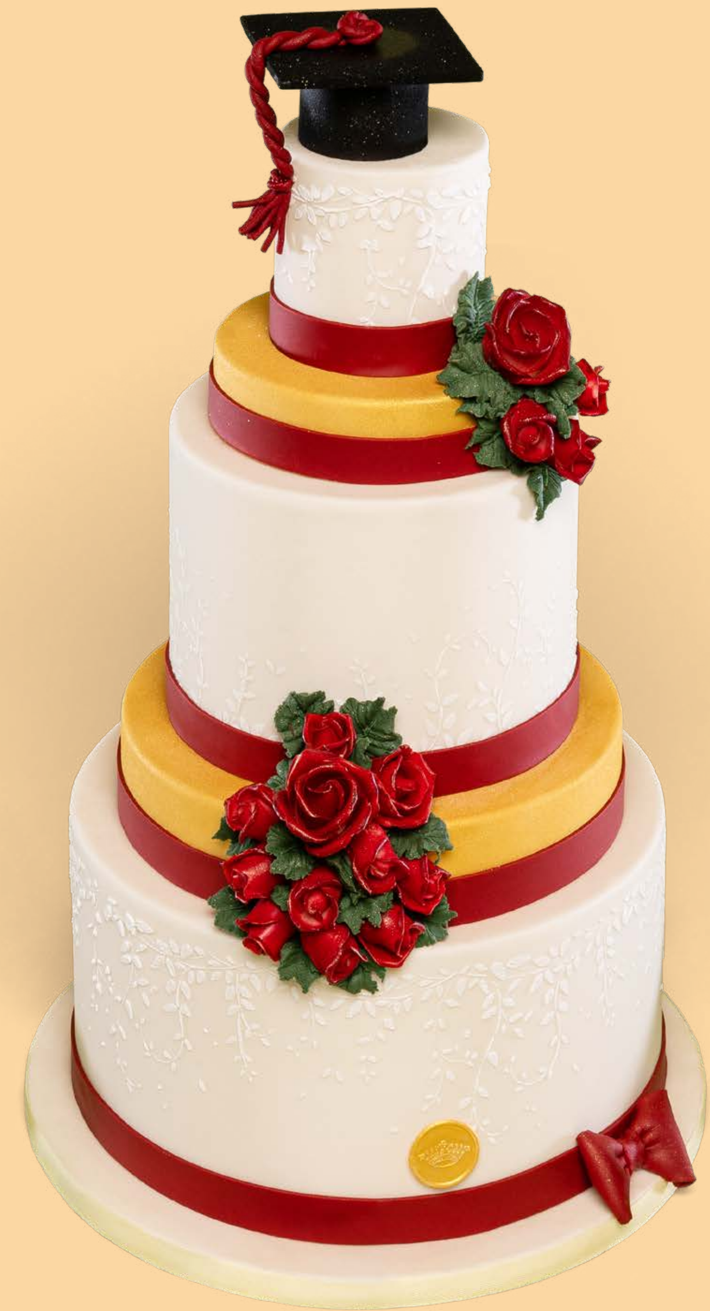
Color: CLR005 Base decoration: DCR004