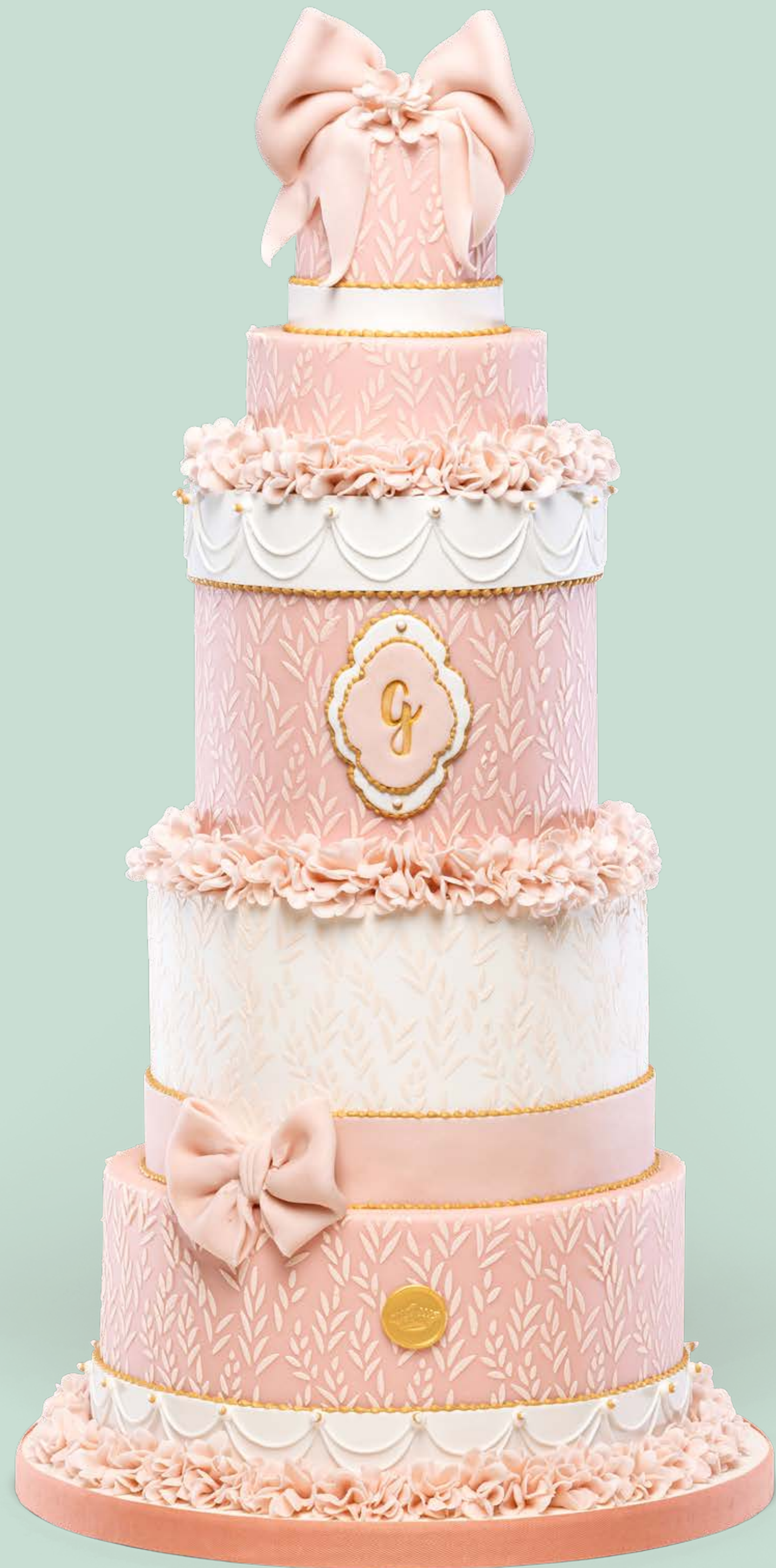
Color: CLR004 + CLR006 Base decoration: DCR002