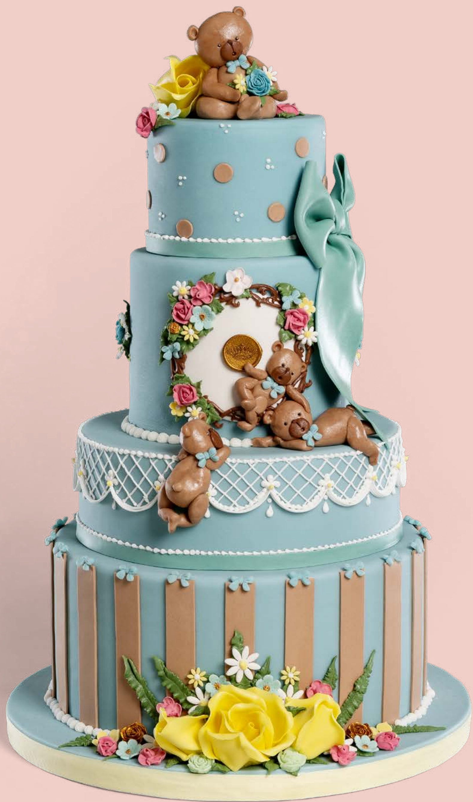
Color: CLR002 Base decoration: DCR026