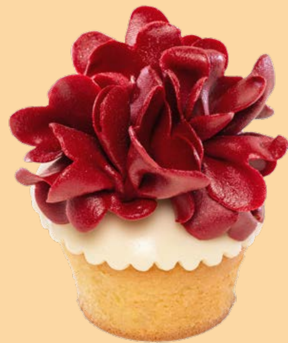
Decorated muffin MF006