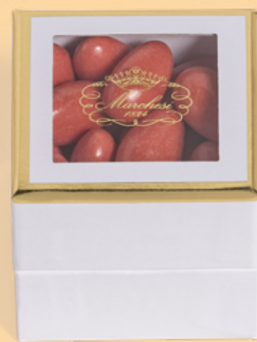
Customizable cube of confetti