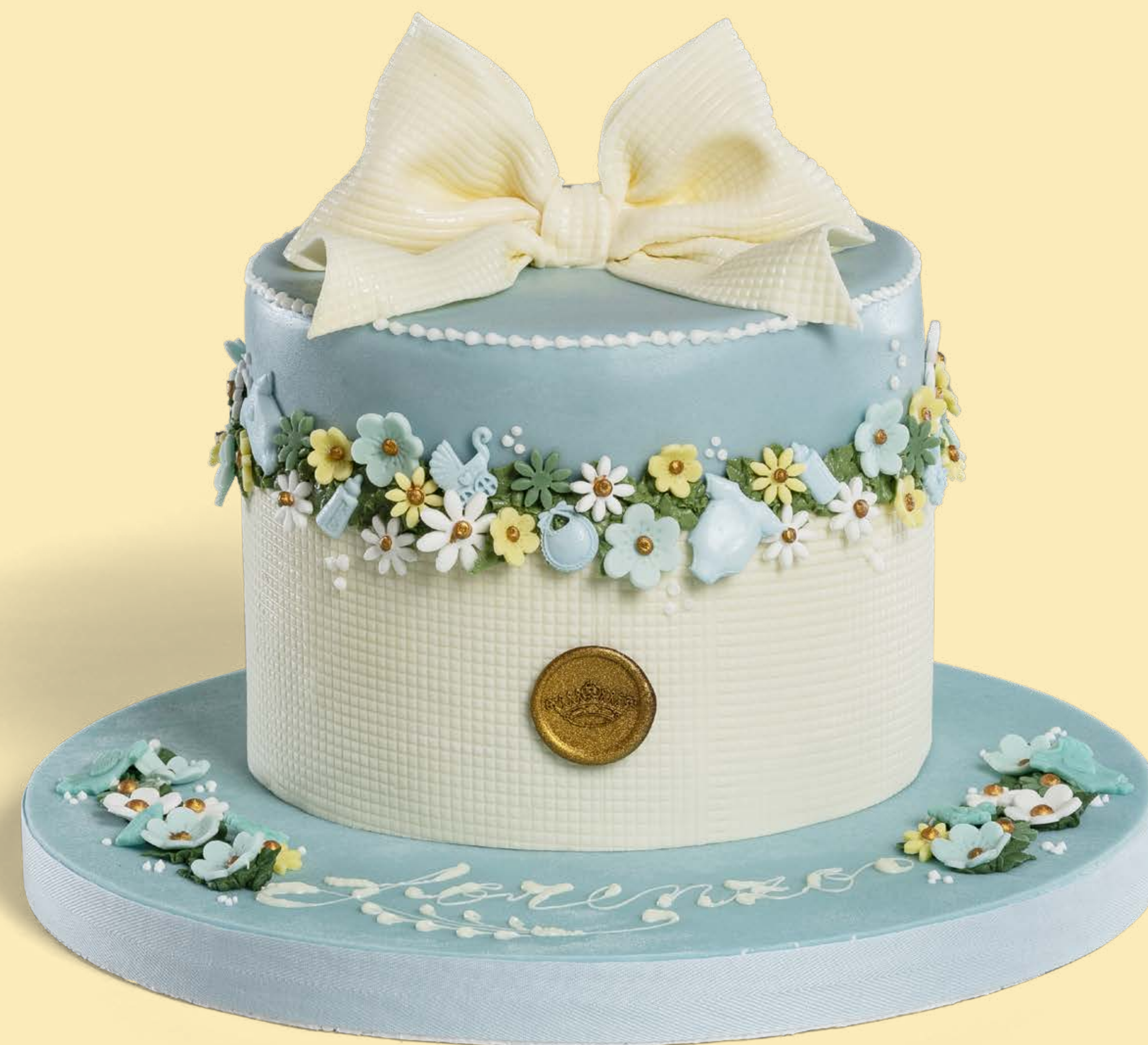
Color: CLR005 + CLR008 Base decoration: DCR021