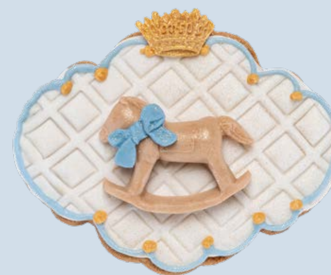
Decorated biscuit BSC022