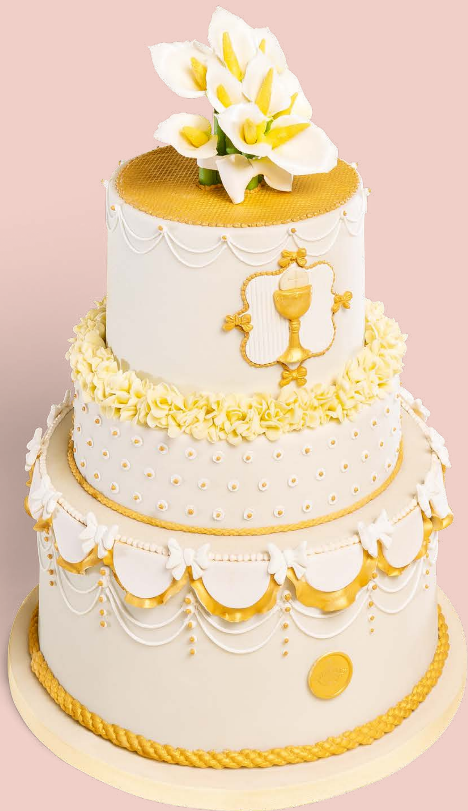
Color: CLR005 Base decoration: DCR005