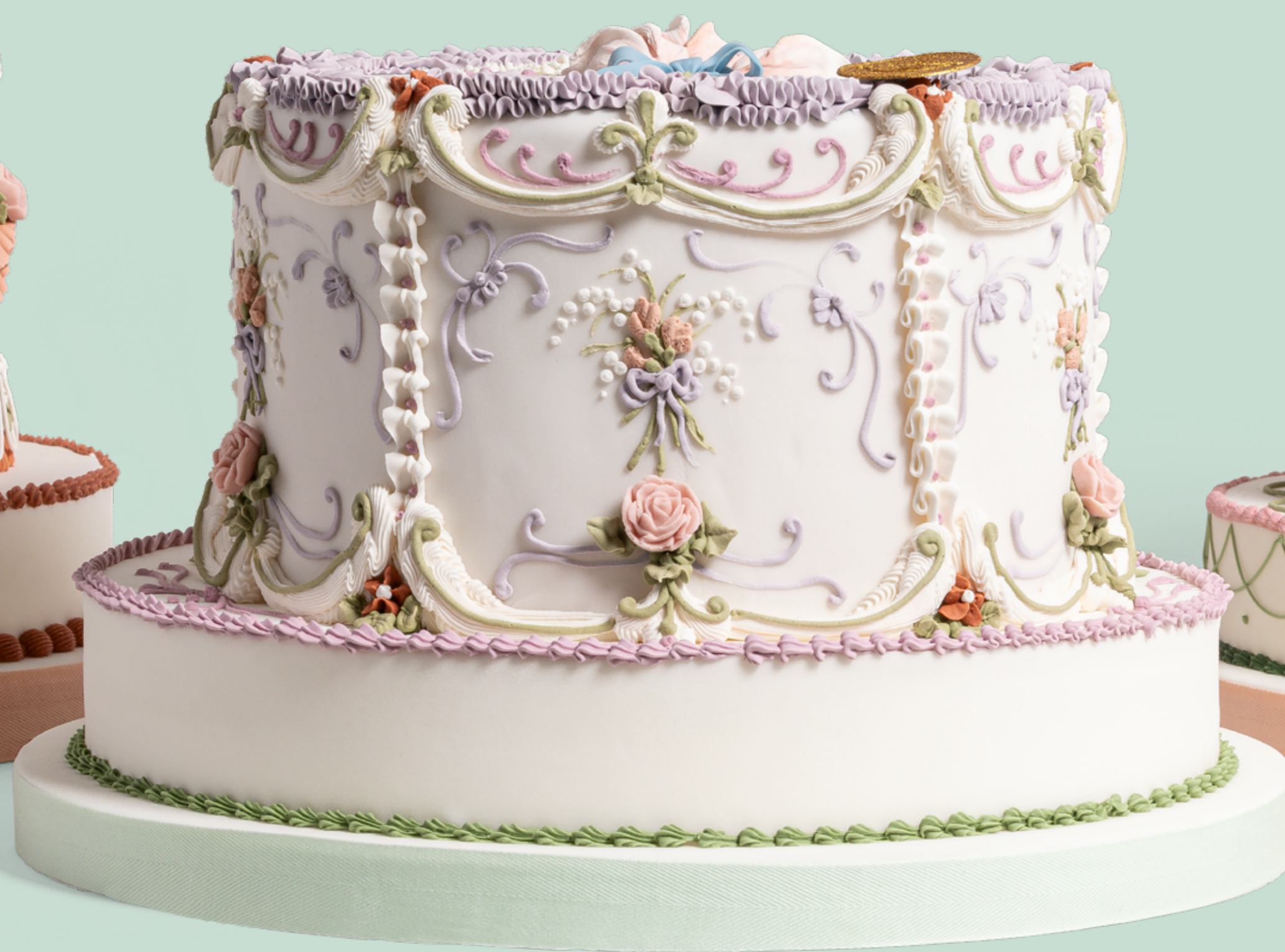
Color: CLR006 Base decoration: DCR028