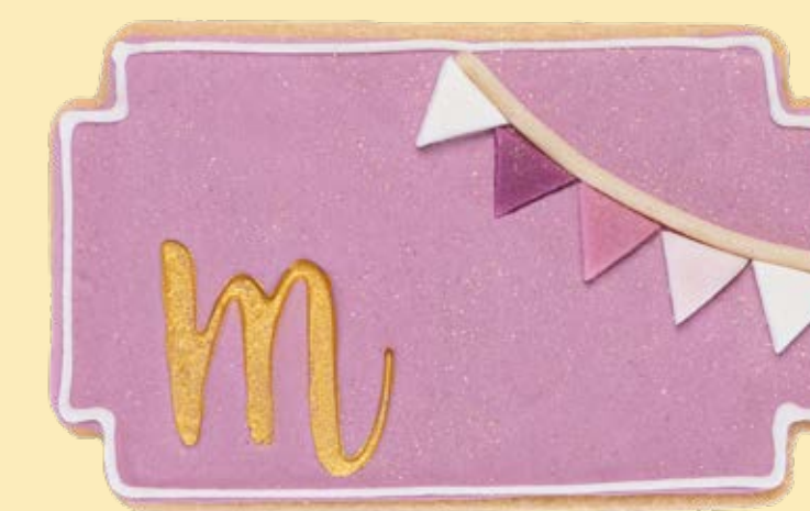
Decorated biscuit BSC018