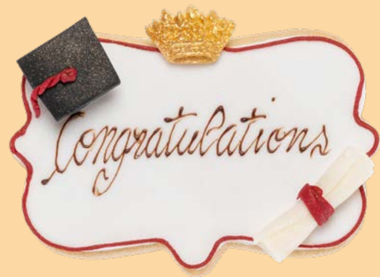
Decorated biscuit BSC006