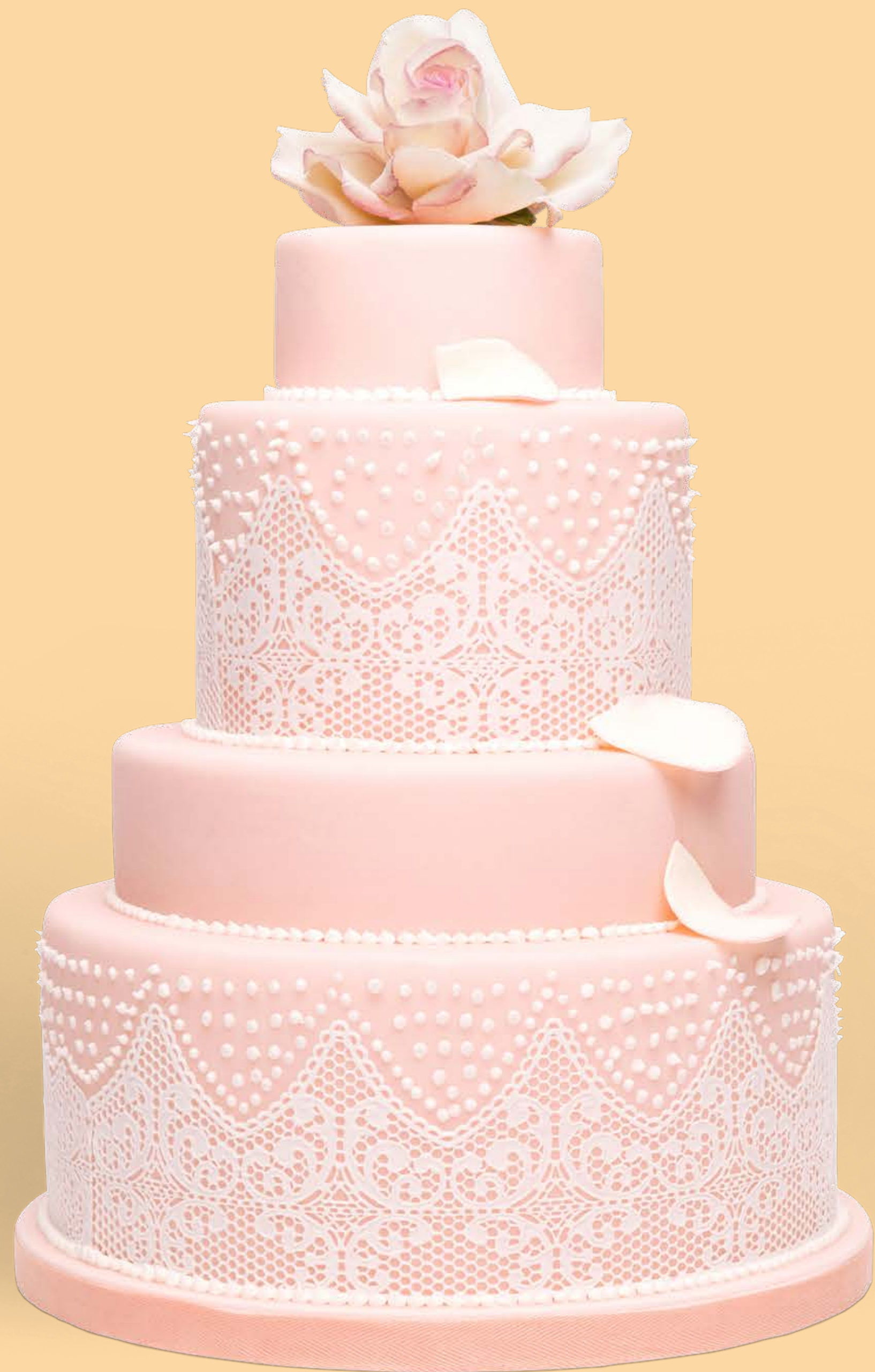
Color: CLR004 Base decoration: DCR011