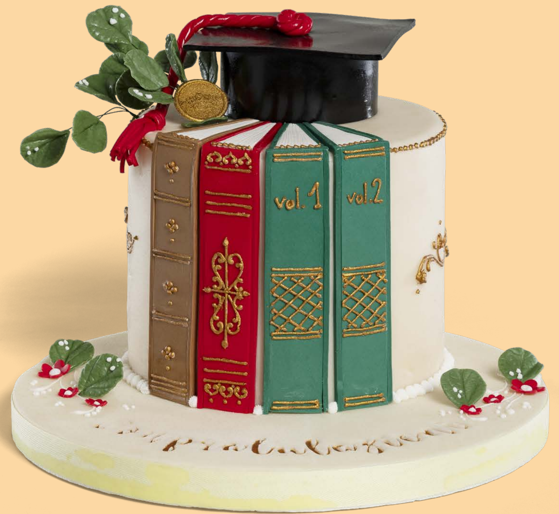
Color: CLR005 Base decoration: DCR025