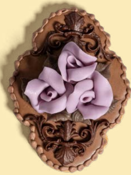
Decorated biscuit BSC103