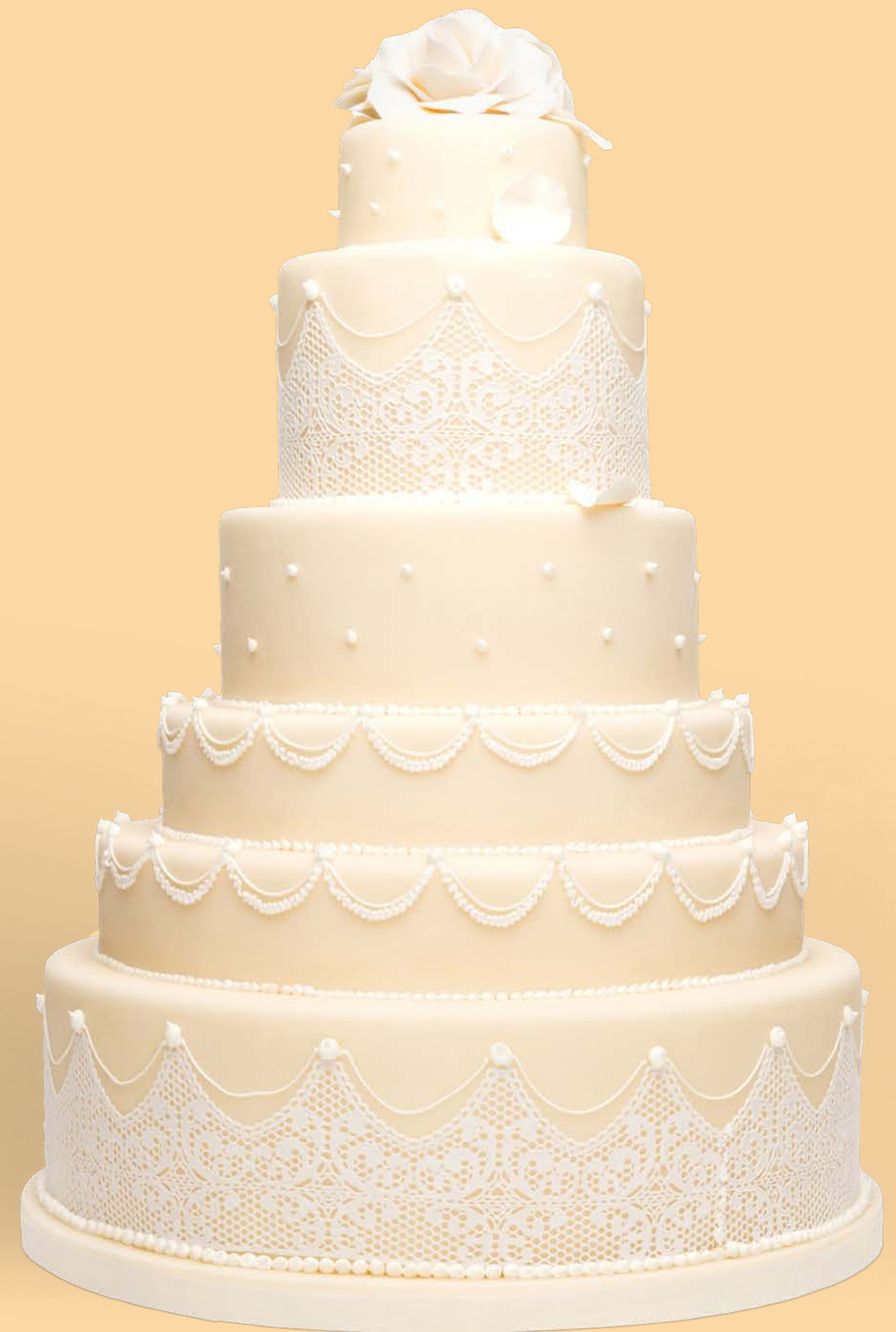
Color: CLR005 Base decoration: DCR0026