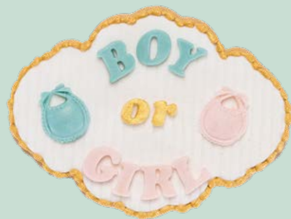
Decorated biscuit BSC011