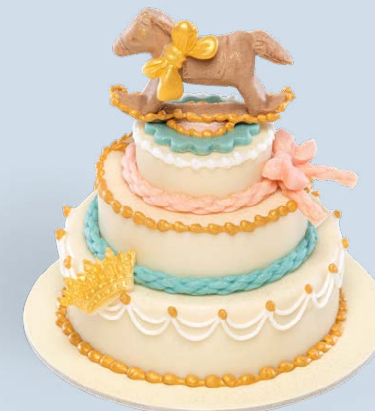
Mignon ceremony cake from € 15,00 to € 25,00