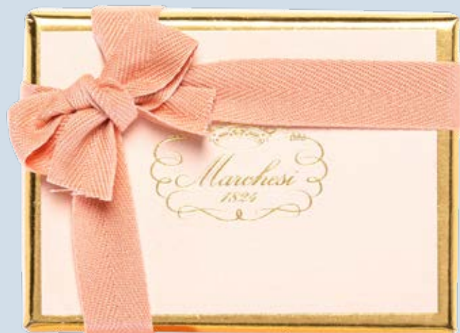
Customizable box of jellies, cremini and pralines