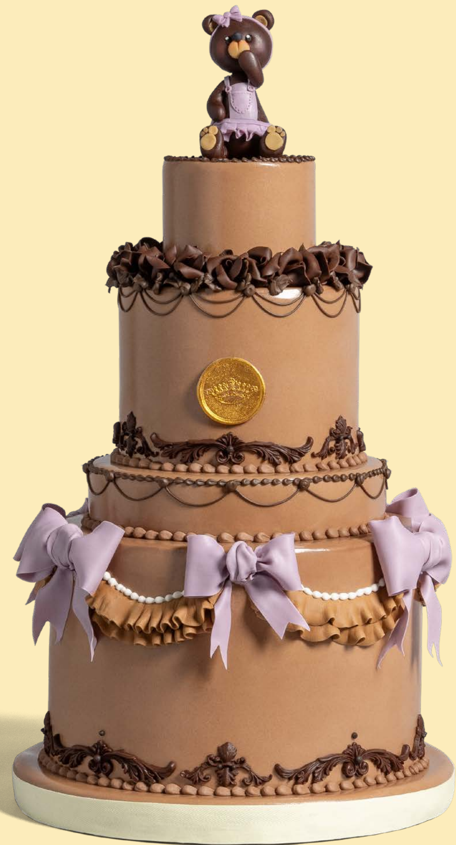
Color: CLR022 Base decoration: DCR0103