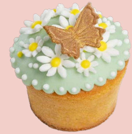
Decorated muffin MF020