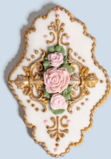
Decorated biscuit BSC100