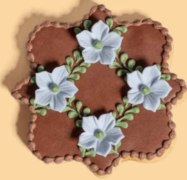
Decorated biscuit BSC101