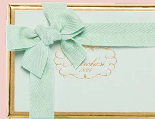
Customizable box of jellies, cremini and pralines