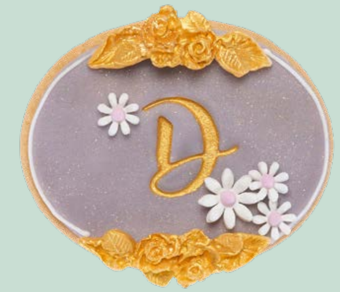
Decorated biscuit BSC002