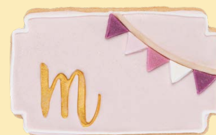
Decorated biscuit BSC017