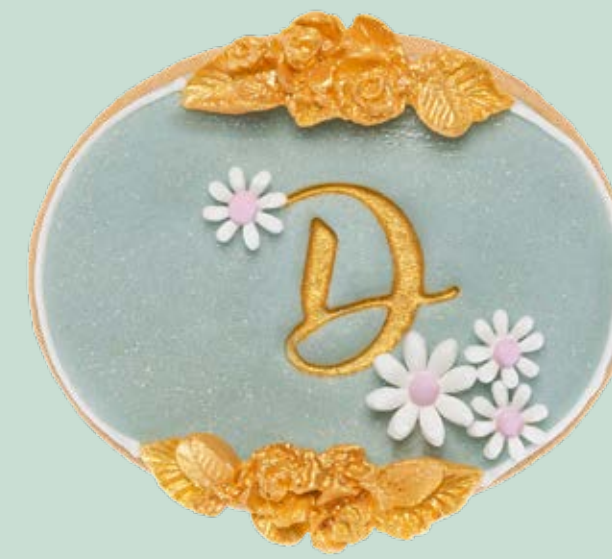
Decorated biscuit BSC001