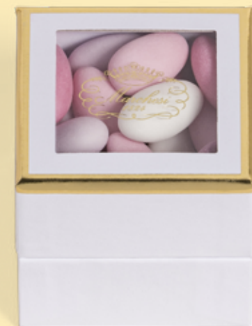
Customizable cube of confetti