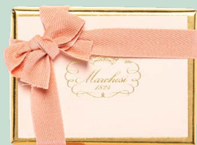
Customizable box of jellies, cremini and pralines