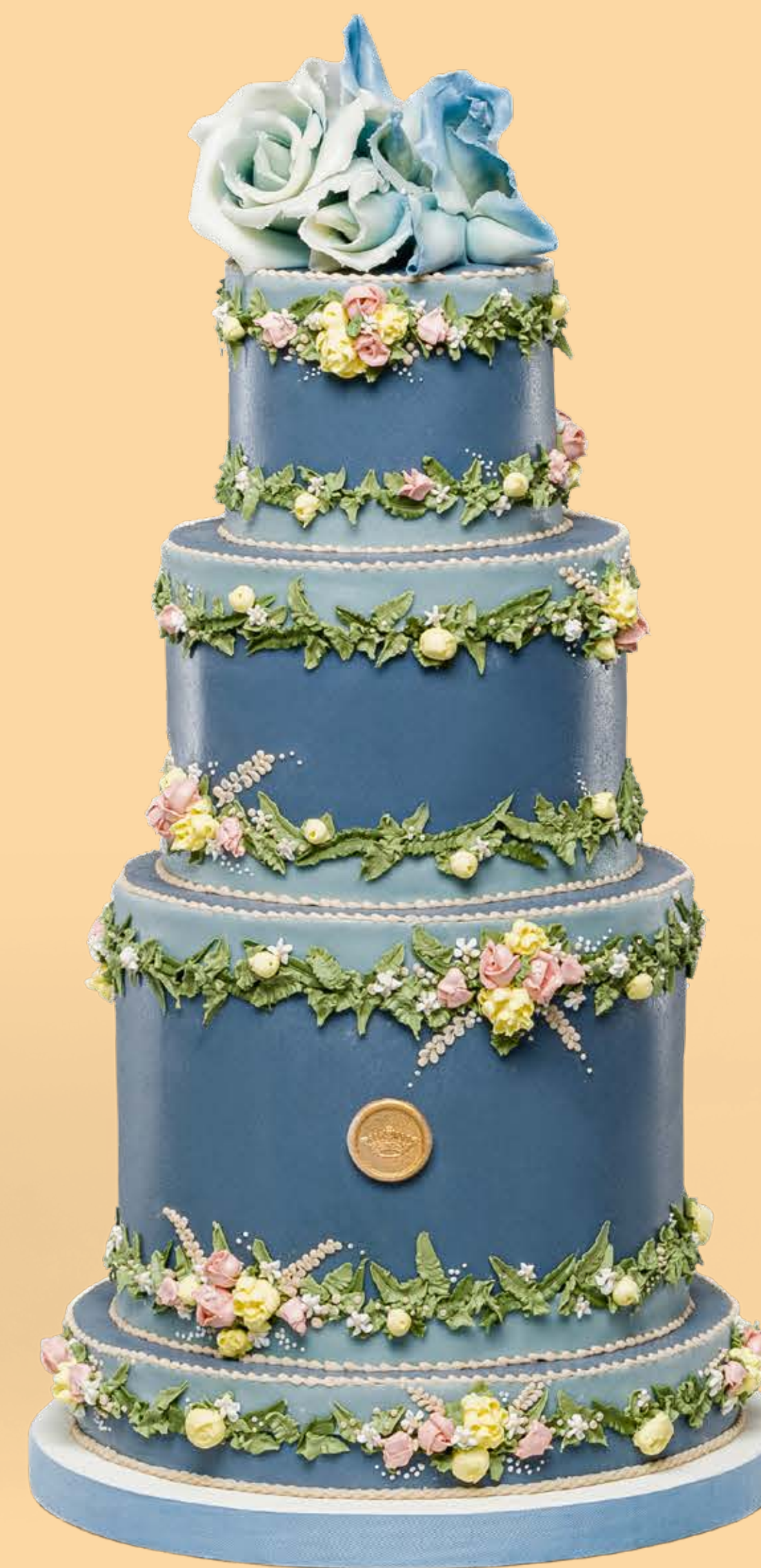
Color: CLR009 Base decoration: DCR017