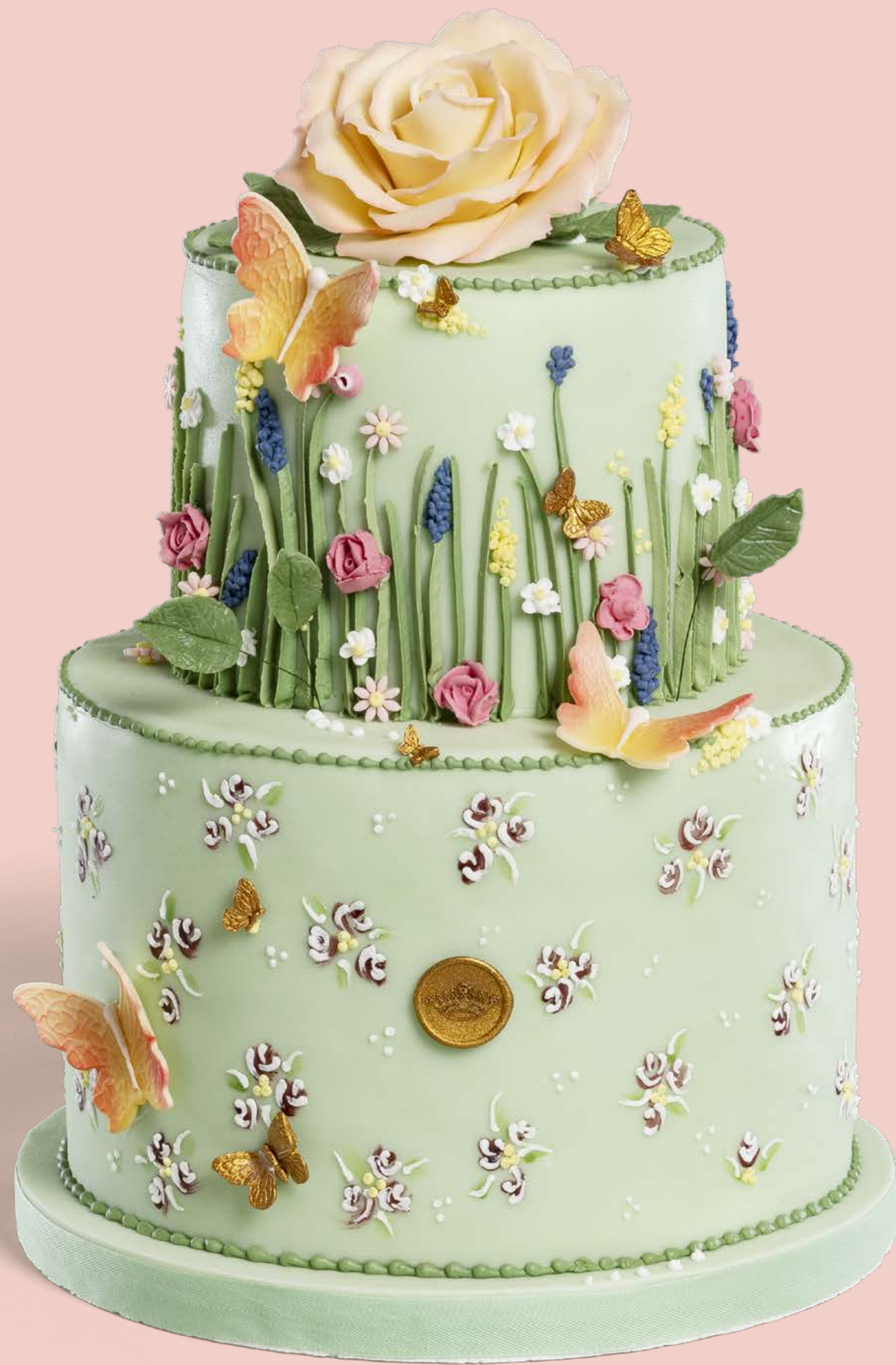
Color: CLR003 Base decoration: DCR020