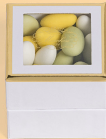
Customizable cube of confetti