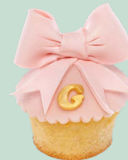
Decorated muffin MF004