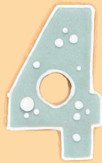
Decorated biscuit BSC021