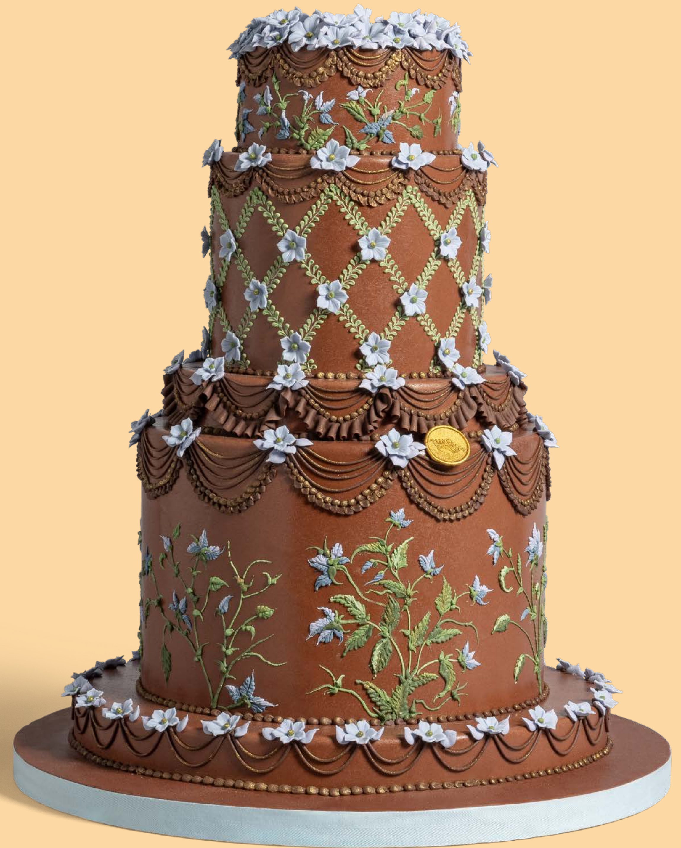
Color: CLR021 Base decoration: DCR0101