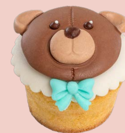
Decorated muffin MF022