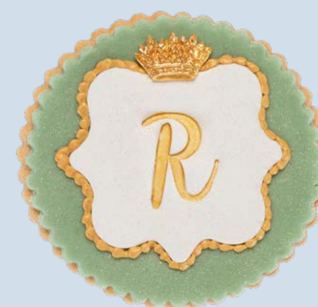
Decorated biscuit BSC023