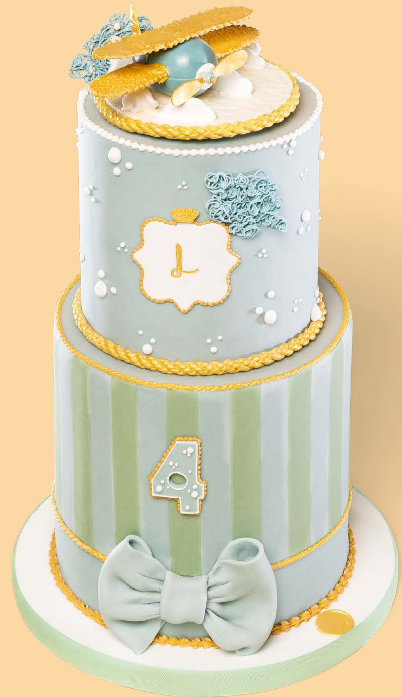
Color: CLR007 + CLR008 Base decoration: DCR009