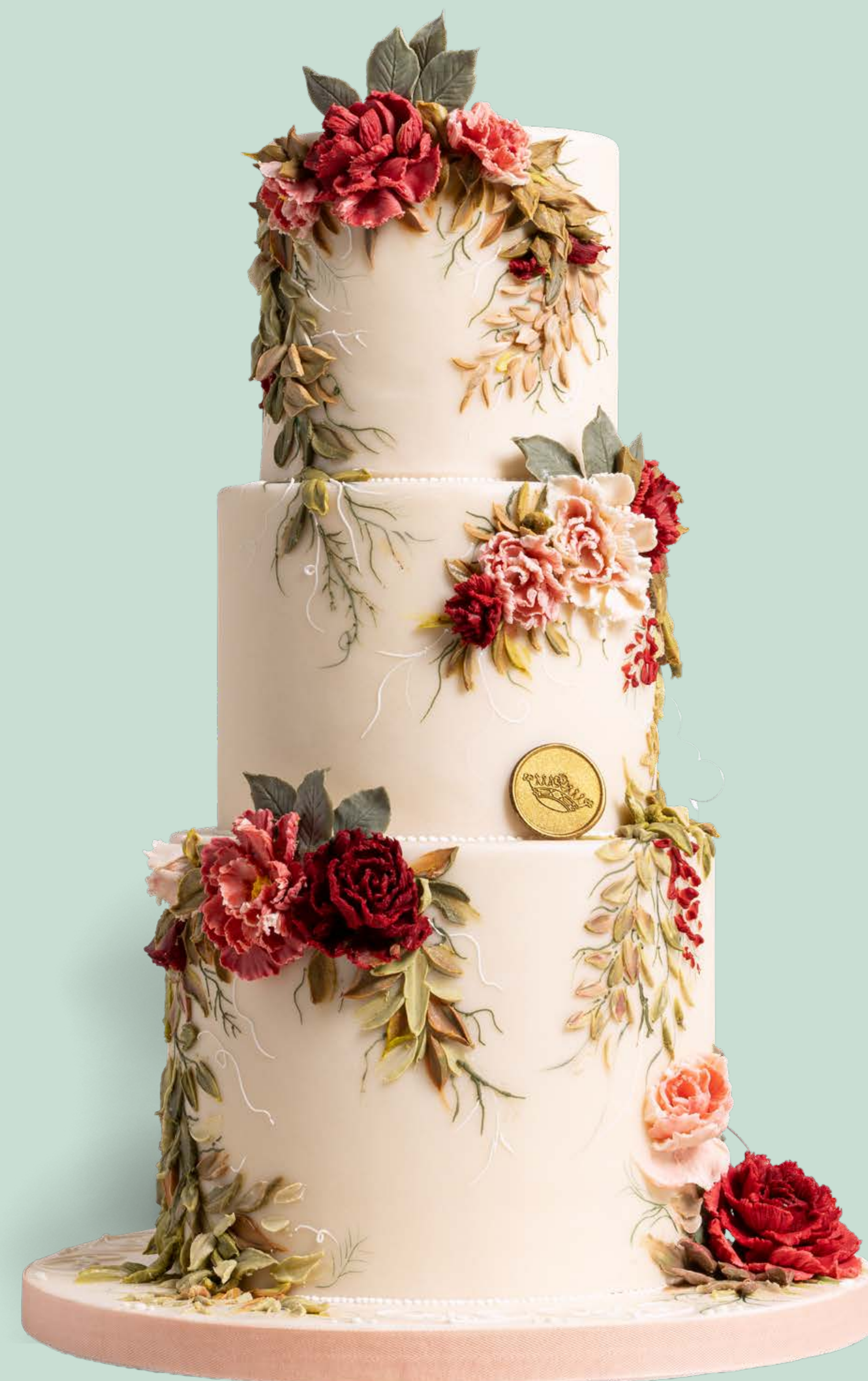
Color: CLR005 Base decoration: DCR031