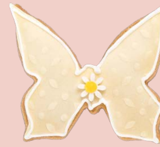
Decorated biscuit BSC020