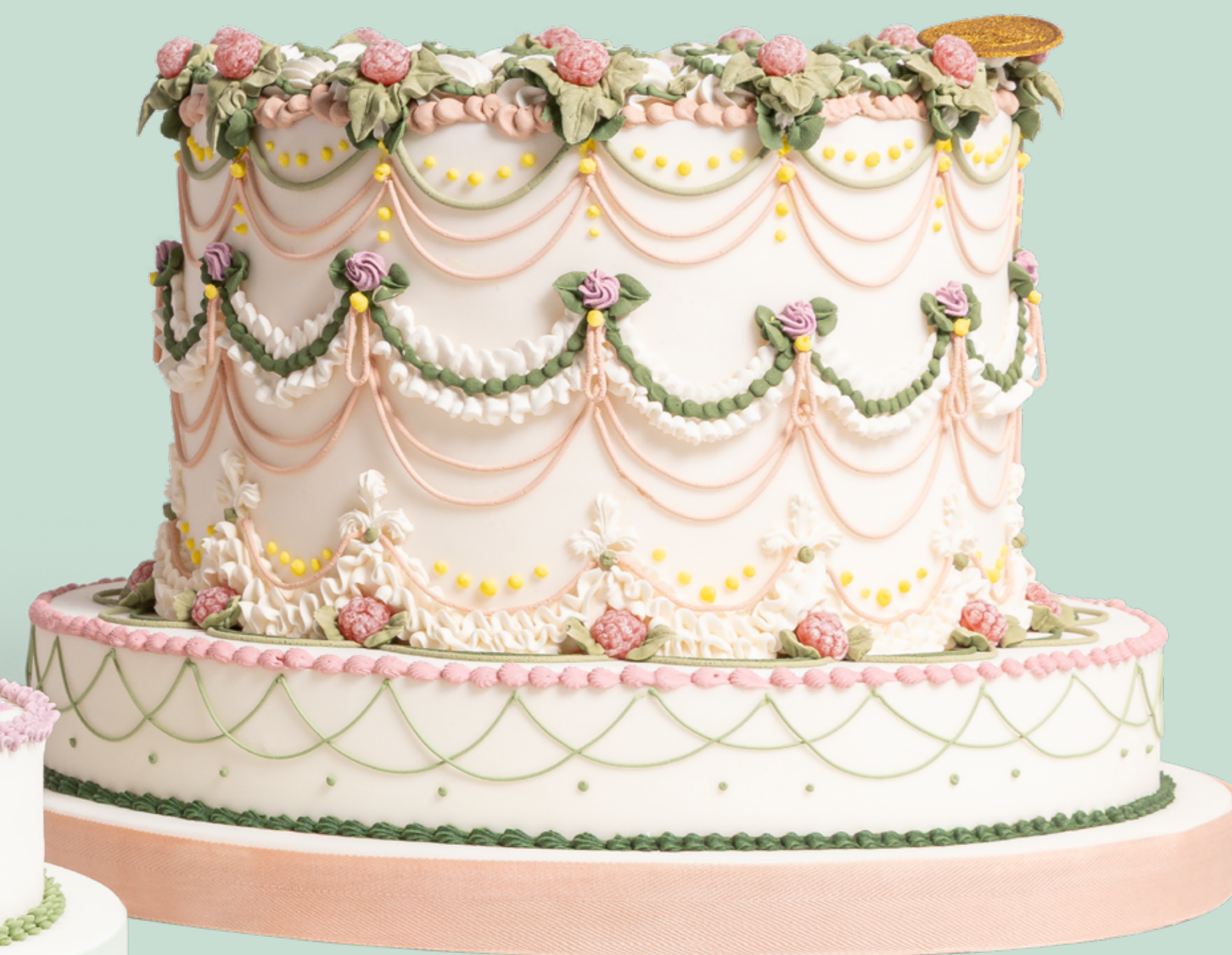
Color: CLR006 Base decoration: DCR029