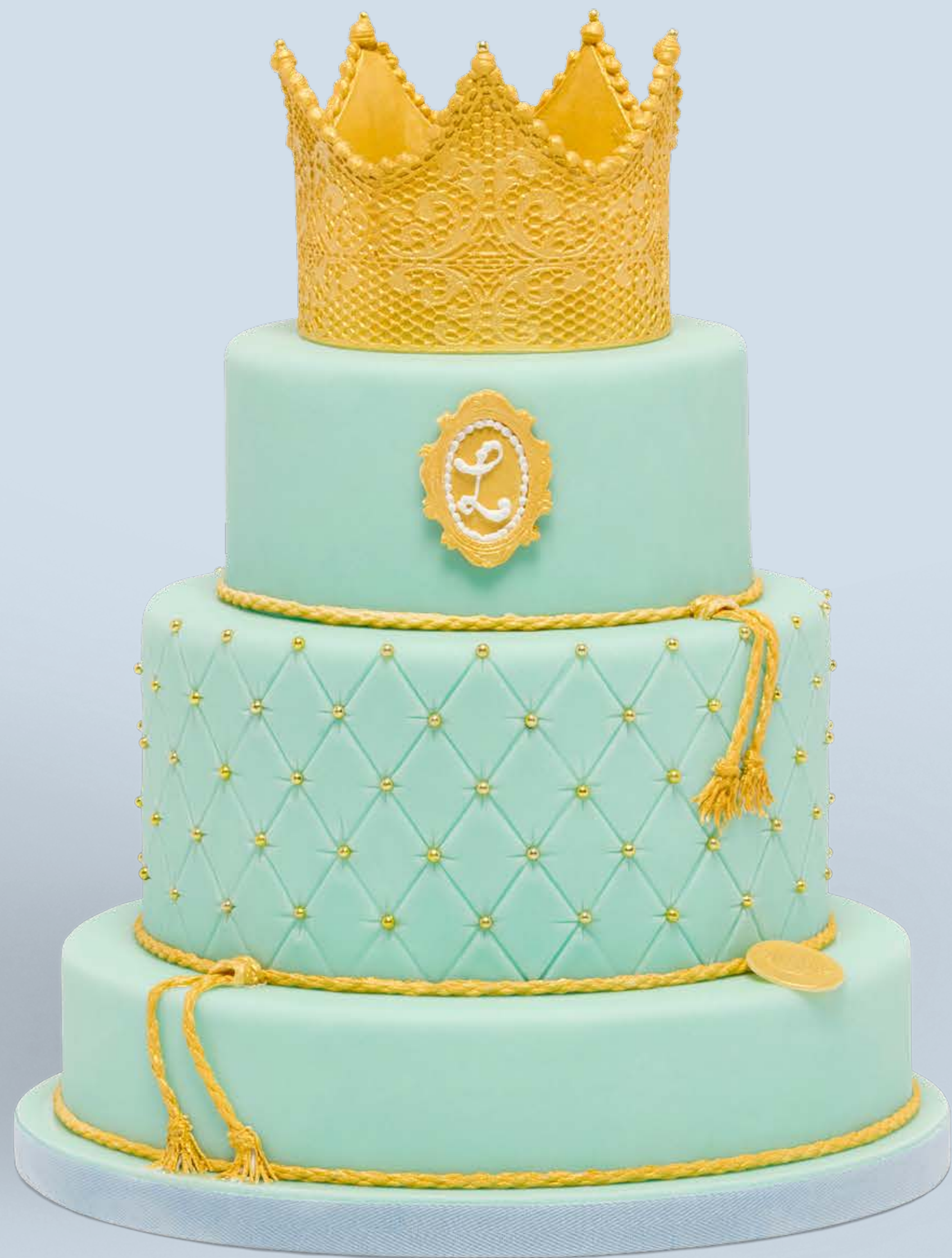
Color: CLR002 Base decoration: DCR013