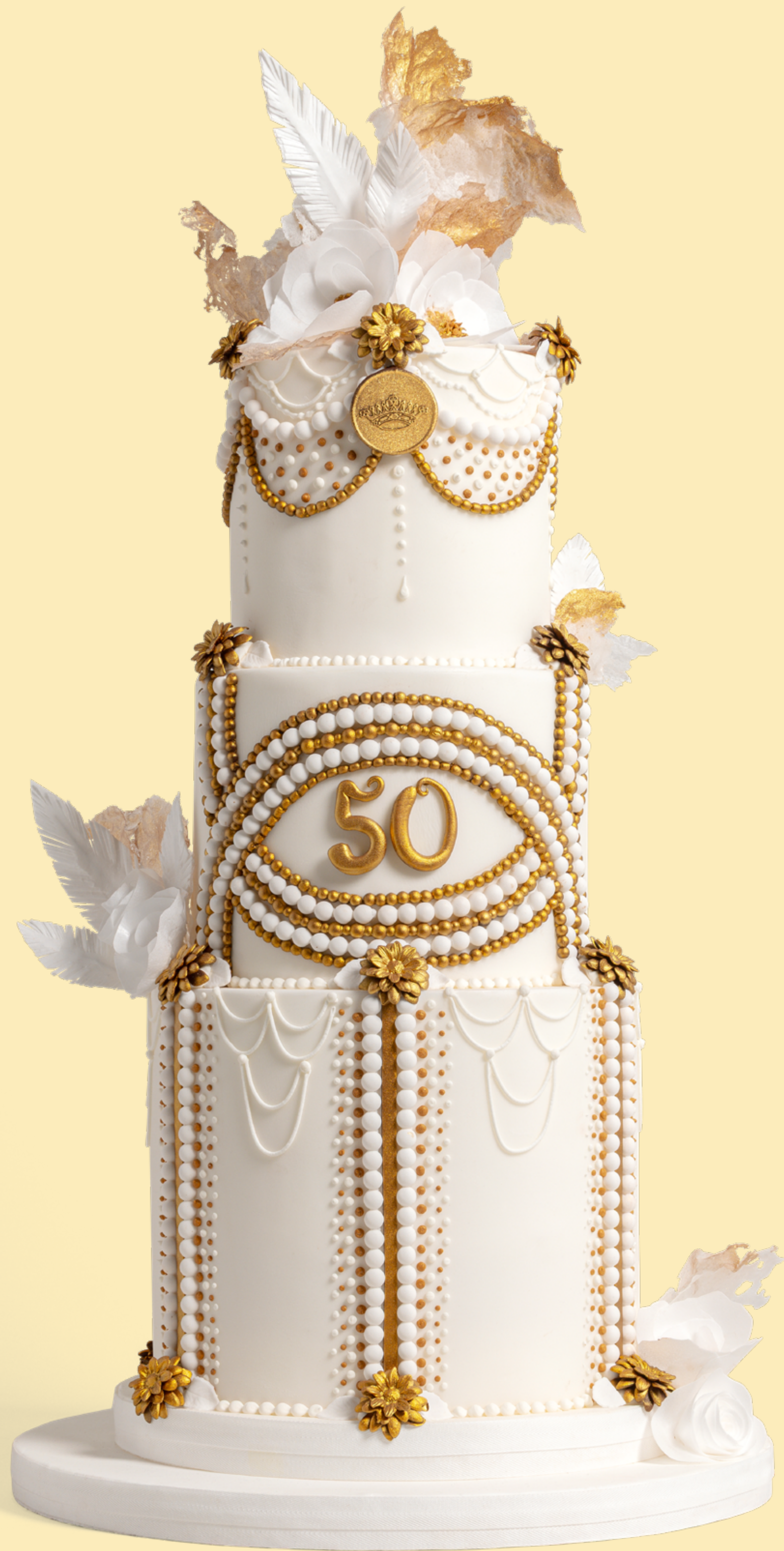
Color: CLR006 Base decoration: DCR032