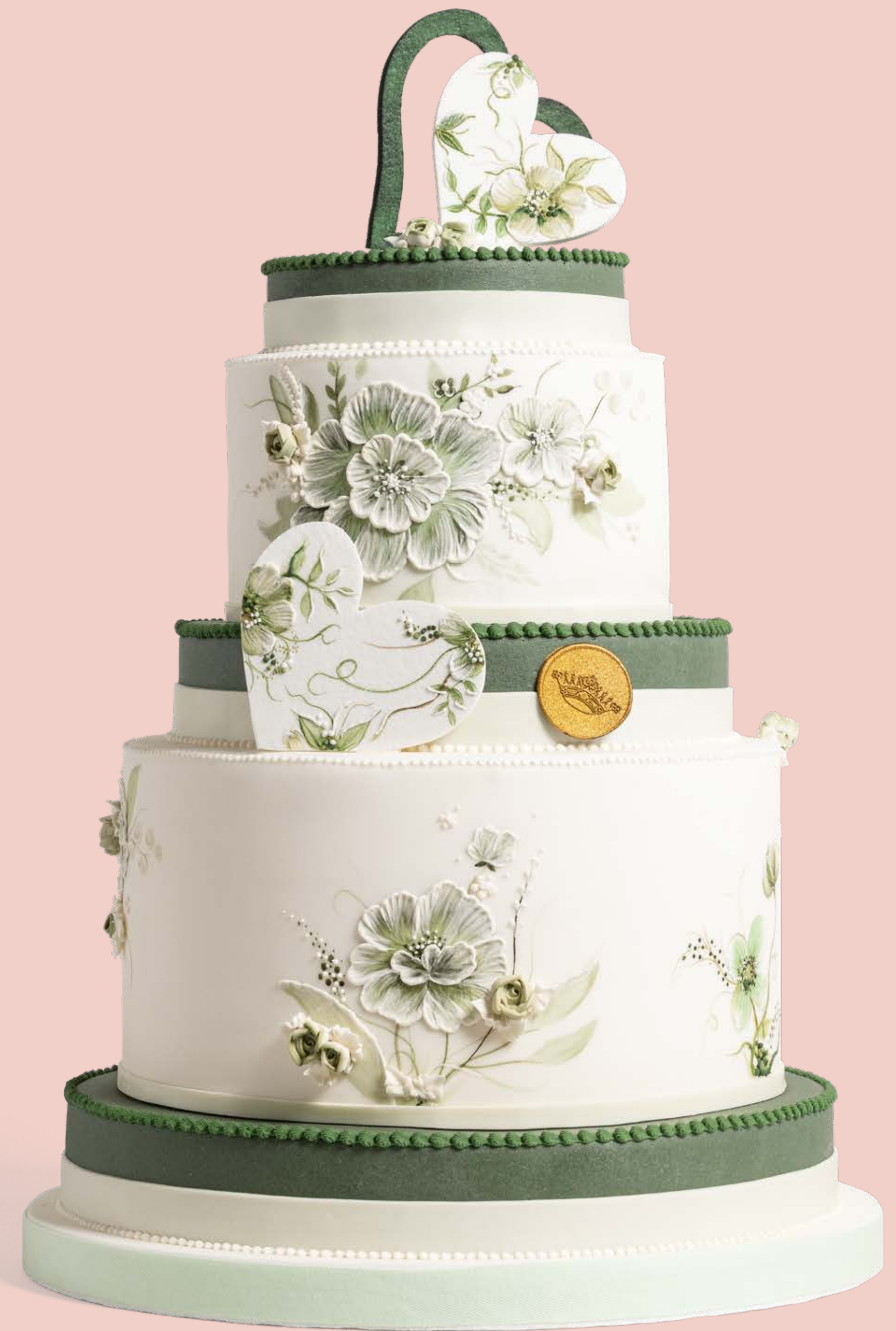
Color: CLR006 + CLR007 Base decoration: DCR035