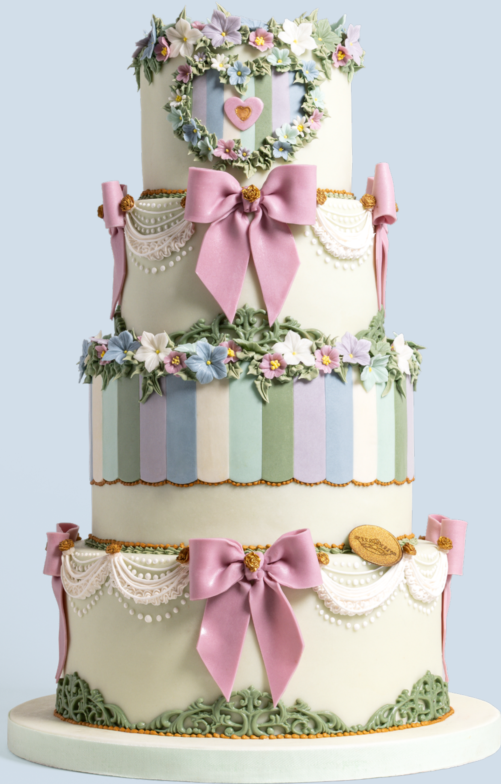
Color: CLR010 Base decoration: DCR030