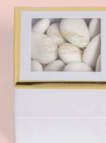
Customizable cube of confetti